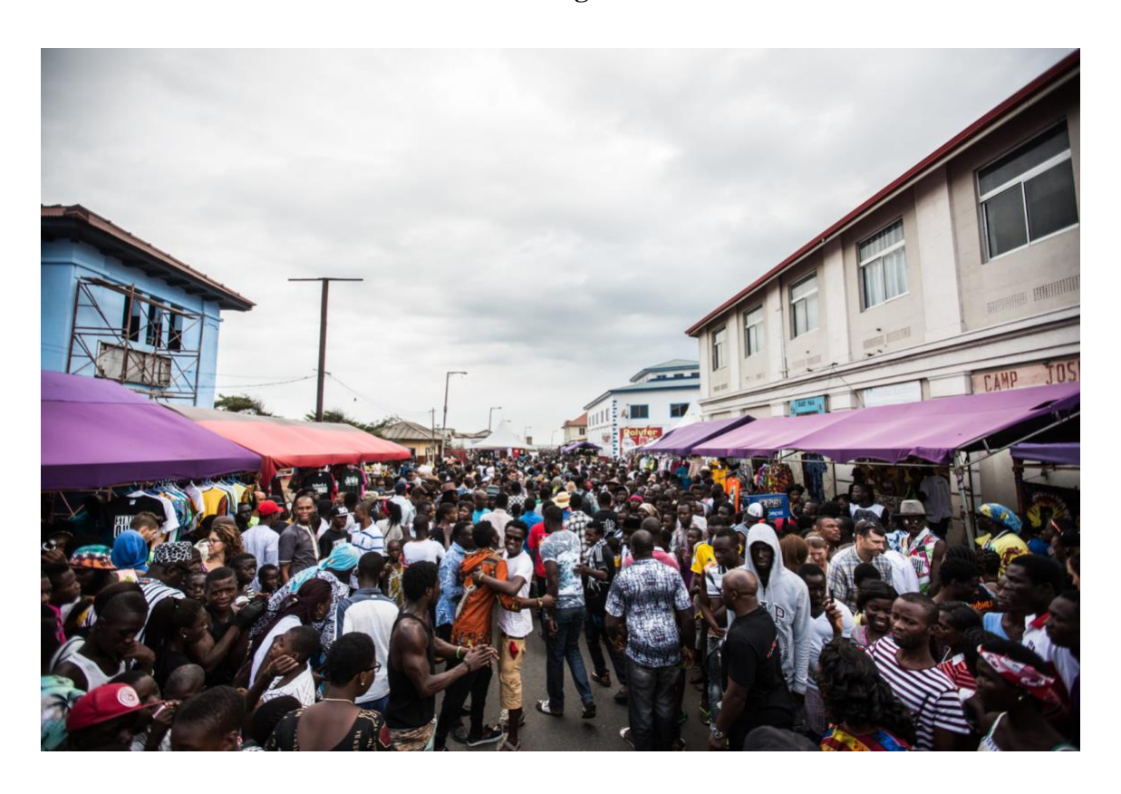
Fig 5 Page 38 of 111