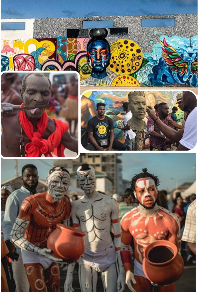
Fig 3: CWSAF ART DISPLAY