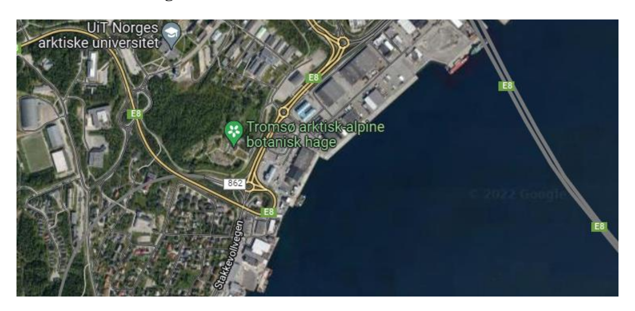
Figure 2: satellite view of the botanical garden and areas around it

Cultivating plants in cold environments can present challenges, but it can also be advantageous for species that do not thrive in warmer temperatures. These plants can often be found in remote mountainous areas, inaccessible to the public. In response, a botanic garden was established in Tromsø, Norway, specifically designed to highlight such flora. The Tromsø Botanic Garden is the northernmost botanical garden in the world and features a diverse collection of Arctic, Antarctic, and Alpine plants from all continents. Located near the city's industrial district Breivika with the harbor, the garden is surrounded by a lot of sites producing great amounts of pollution.