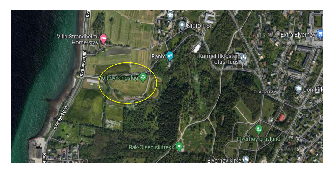
Figure 3: satellite view of Holt

The second institution I focused on was a community garden based on Tromsø island close to the agricultural research center NIBIO, called Holt Økopark. Holt serves as a community garden, emphasizing urban gardening as a practical means of learning. The land on which Holt Økopark is situated is available for individual, non-commercial gardening and is located away from the residential areas of the users. The land is divided into small, private plots and