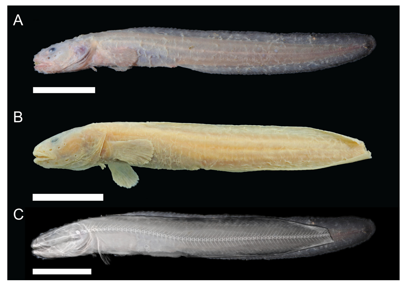
FIGURE 1. Holotype of Pyrolycus jaco sp. nov. , SIO 20-41, 107+ mm SL, Jacó Scar, Costa Rica A) freshly collected; B) in preservation, note caudal region removed by collectors; C) superimposition of radiograph over fresh image to estimate vertebral count. Scale bar= 20 mm.

Coloration in preservation (Fig. 1B) . Holotype uniformly tan, body semi-translucent. Fins tan with slight mottling on pectoral fins. Paratypes in 95% ethanol, light tan with very faint mottling body, head and fins (especially SIO 20-42).