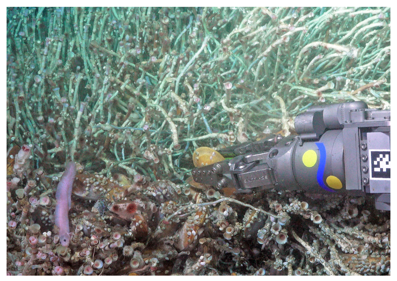
FIGURE 4. Live images of Pyrolycus jaco sp. nov. , not collected, living among Lamellibrachia barhami and Escarpia spicata colonies.