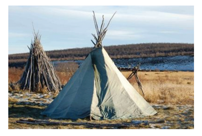
Figure 2. Traditional lávvu.