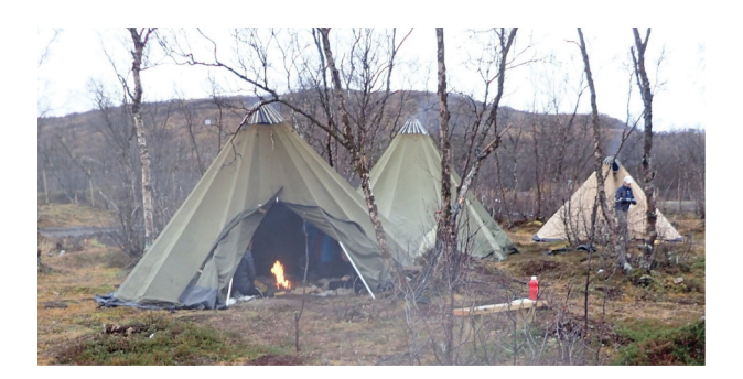
Figure 1. Modern lávvues.