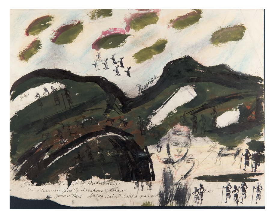
Figure 1 Johan Turi, Untitled (Spring migration), date unknown. Mixed technique (pastel, watercolour, gouache, Indian ink and pencil, or similar) on paper, 24.8 × 31.9 cm (irregular). Various inscriptions, with signature and prize, lower left: "Johan Thuri 9 kr". Nordiska Museet, Stockholm. The Johan Turi Archives, LA 659, No. 39, Box J1:1.

in this volume, and Sjoholm (2017). 4 Lappmark, a territorial area, may be translated as Sámi land. "Lapp" is a derogatory historical term for "Sámi".