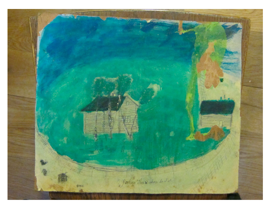
Figure 5 Johan Turi, Untitled (Landscape with houses, humans, reindeer, and a giant), date unknown. Mixed technique (watercolour or gouache, pastel and pencil, or similar) on cardboard, approx. 36 × 40 cm (irregular). Nordiska Museet, Stockholm. The Johan Turi Archives, LA 659, No. 12, recto, Box J1:1.

to the right, perhaps the artist with his characteristic clothing and tasselled hat. Next to them stand two reindeer. The surprisingly giant humanoid on the right might be a Stallo/Stállu , though its head is hidden from view. In Sámi tales, Stállu is a dangerous, evil, but simple-minded spiritual figure. The giant's arm and enormous hand hover over the smaller log house, potentially threatening the safety and comforts of the home.