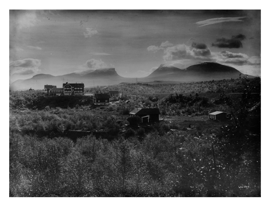
Figure 3 Borg Mesch, Ábeskovu with Čuonjávággi/The Lapponian Gate behind, 4 September 1911. Photograph. Kiruna MediaGallery. Archive No. 10000507. Reproduced with the permission of Kiruna kommun.