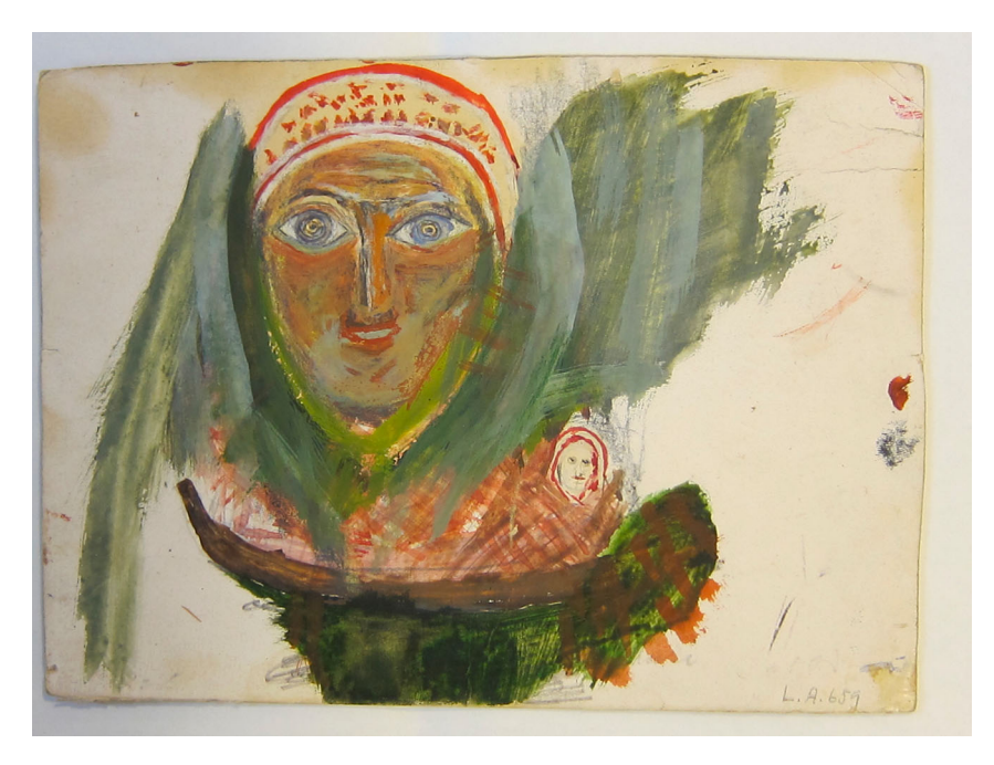
Figure 8 Johan Turi, Untitled (Stállu and his wife, Luttak, on a sleigh), date unknown. Mixed technique (pastel, gouache and pencil, or similar) on cardboard, 17.9 × 24.6 cm (irregular). Nordiska Museet, Stockholm. The Johan Turi Archives, LA 659, No. 53, Box J1:1.

compositional equilibrium. It is as if they insist, in line with his texts, that if the Sámi live up to their traditional knowledge and behave cautiously and respectfully, it is possible to reach the higher goal of what is good and pleasant ( hávski ). At the same time, Turi's imagery also shows environs and situations that are challenging, even dangerous.