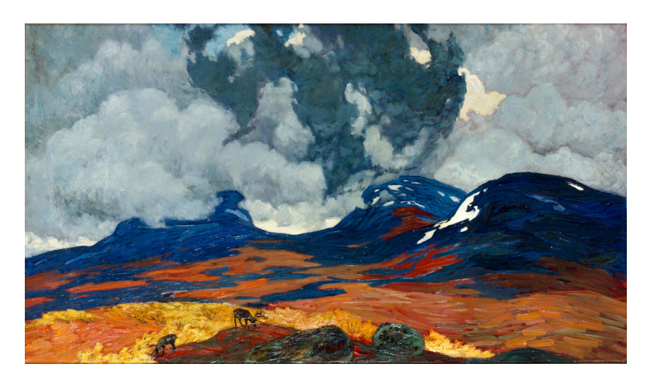
Figure 2 Helmer Osslund, Före stormen, motiv från Lapporten (Before the storm, motif from Čuonjávággi/The Lapponian Gate), c. 1907. Oil on canvas, 58 \times 100 cm. Whereabouts unknown, sold at Bukowskis, Stockholm, 20 November 2006, lot 75.