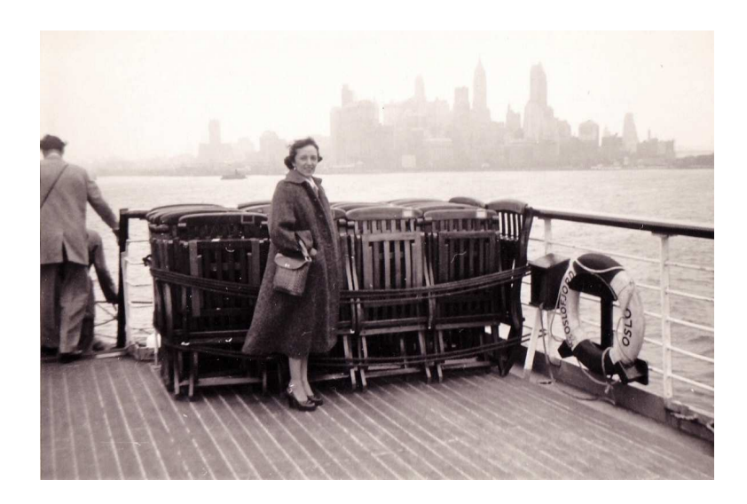
This photo shows "Departure from New York". From a reminiscence participant's photo album.