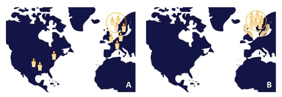
Figure 2: Illustration of parallel change (panel A) and endurance (panel B) perspectives in the founder team on the topic of future physical structure – candles depict hypothetical company presence

Other parts of the founder team emphasize the need to be close to clients for the sake of sales and relationships but also technology co-development and support (Panel B). This view points out that - as the organization grows - it sees itself in a more complex stakeholder landscape and needs to 'change' its organization in response.