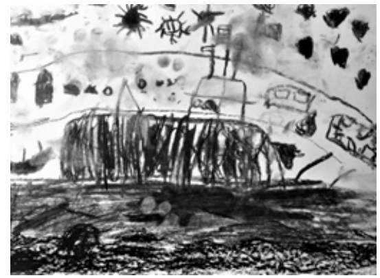
Figure 8. The shipwreck drawn by participant Child 2 with

focused attention to the surroundings, the environment and the materials in a dynamic form of engagement with movements, landscapes and places. Based on chorotopos as a perspective, children's aesthetic activity and performances provide awareness of the local environment. These performances are discussed as a way of meaning making of the shoreline as a place. The children's photographs and drawings are seen as opportunities for the children to reflect on their experiences of their trips to the shoreline (Figure 8 that shows the shipwreck drawn by participant Child 2 and Figure 9 that shows the shipwreck drawn by participant Child 5). Both children in these drawings used coal as a drawing material which also can be connected with the history behind the ship carrying coal.