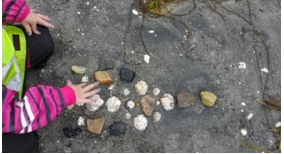
Figure 3. Performing forms of the shipwreck with natural materials found at the shoreline