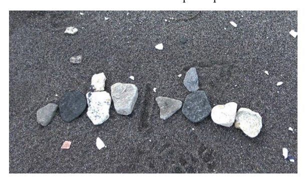
Figure 4. Performing Land Art with ten selected stones at the shoreline