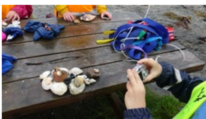
Figure 7. Collecting natural elements for Land Art: the researchers' perspective