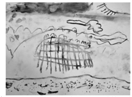
Figure 9. The shipwreck, drawn by participant Child 5 with coal

Our video recordings of the drawing process were included in the analysis. During the conversation at the start of the process, the following dialogue between the kindergarten teacher and a child was recorded: