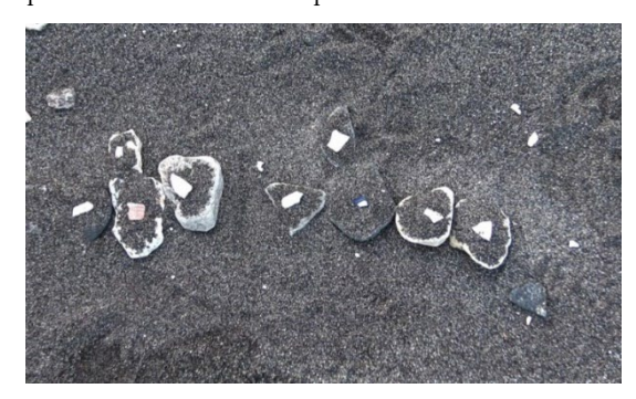
Figure 5. A continuous performing of Land Art from Child 2 by adding sand at the ten selected stones

A child showed Researcher 2 what they had made (Figure 4) and drew a line in the middle.