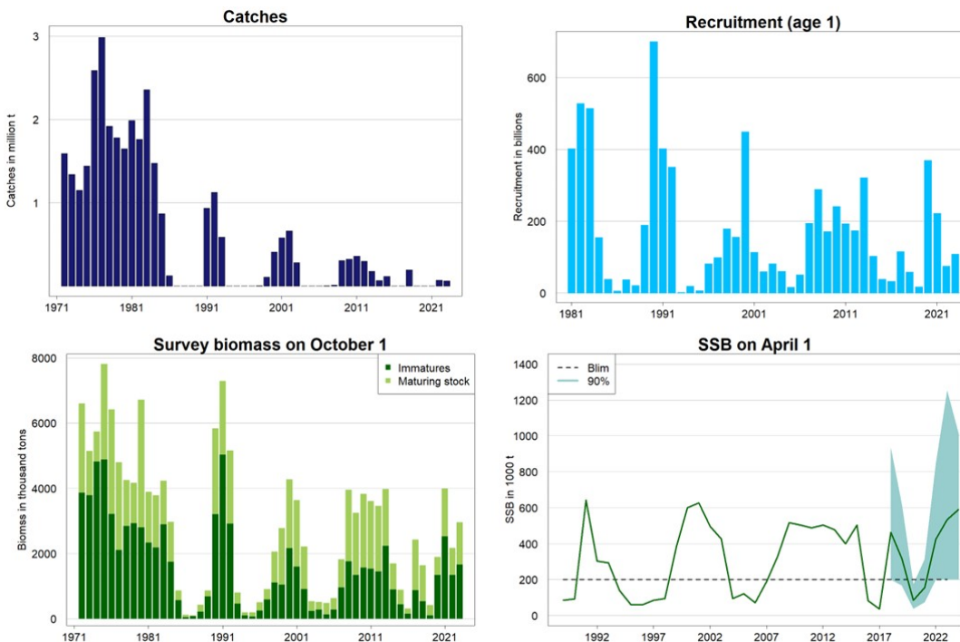
Figure 1. Barents Sea capelin (ICES subareas 1 and 2, excluding Division 2.a west of 5°W). Catch, recruitment, survey biomass (age 1+, maturing (> 14cm) and immature (< 14 cm) stock biomass), and SSB (1 April) with 5 and 95 % confidence limits. The biomass reference points relate to SSB. Survey biomass and recruitment values are estimates from the acoustic survey completed by the beginning of October. The recruitment plot is shown only from 1981 onwards since earlier estimates of age 1 capelin are based on incomplete survey coverage. SSB estimates are shown only from 1989 onwards because a different model was used previously, and uncertainty estimates are only available from 2018 onwards. The 2022 estimate of recruitment, maturing and immature stock biomass has not been corrected for incomplete survey coverage. Incomplete survey coverage in 2018 might also have led to recruitment underestimation.

Spawning-stock size is above B_{lim} . No reference points for fishing pressure have been defined for this stock.