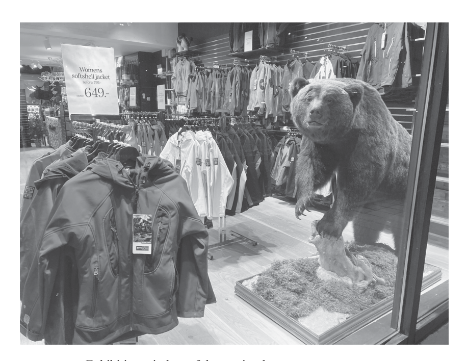
FIGURE 9.1 Exhibition window of the tourist shop.

Figure 9.2 shows the entrance door of the same shop and part of the outer wall. Two small notices are taped to the door: one informing about opening hours, in English only, and one advertising for excursions which can be booked in the shop. The heading is "Your adventure starts here." Below this heading is a list of different excursions: "northern lights, whale watching, dog sledding,