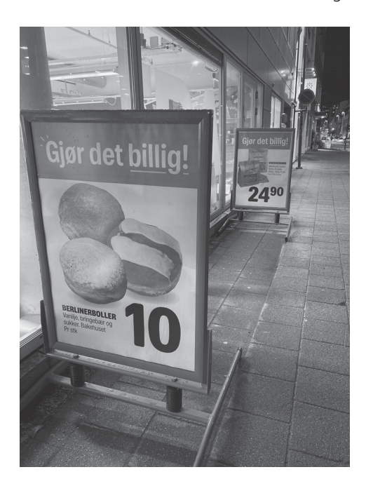
FIGURE 9.3 Advertisement outside the supermarket.

can be seen as a consequence of historical assimilation policies. In the wider linguistic landscape, we observe that this status quo is contested by language activists through placing signs and stickers in Sámi in public spaces.