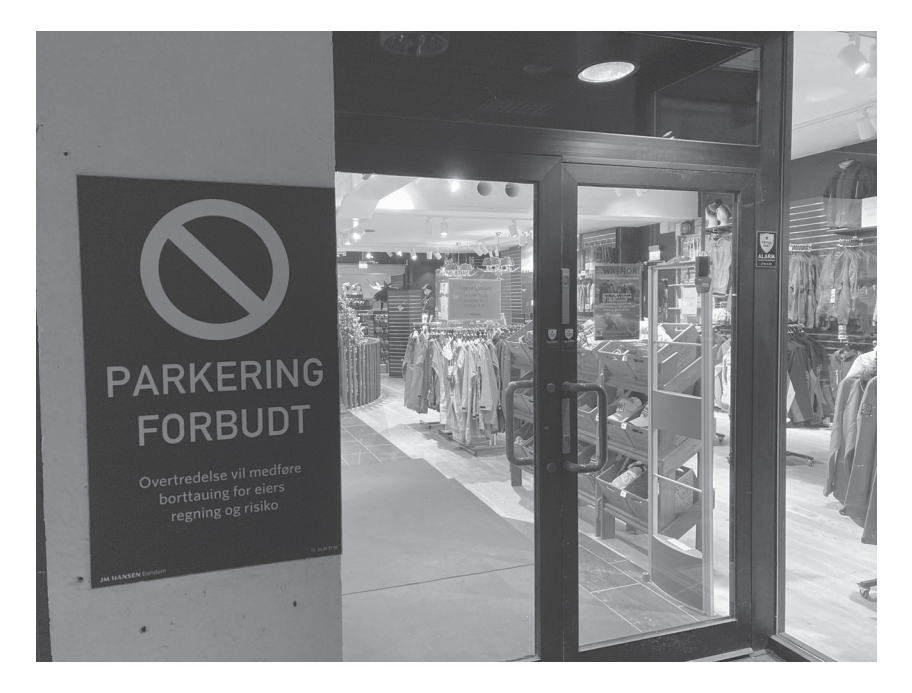
FIGURE 9.2 Entrance door of the tourist shop.

reindeer sledding, snowmobile adventure, whale watching [sic]." The text at the bottom of the sign contains contact information, and there is a stylized reindeer head with large antlers in the lower left corner. The background picture shows a tourist group under the Northern Lights, and, below, two diving orca whales. This notice, as well, is written in English only.