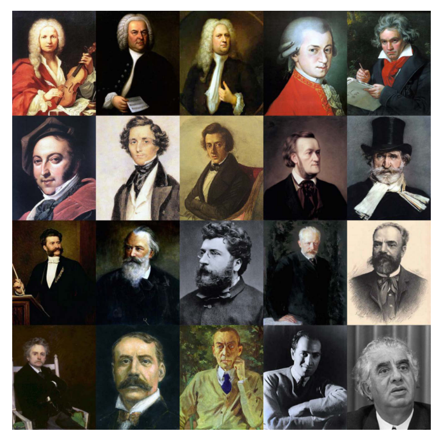
Figure 2. Montage of composers portraying the Western art music canon in Wikipedia/Wikimedia

at UiT is combined with popular music and called rhythmic music). The students' background in music history mainly derives from their high school experiences, where the subject is taught as a reductionist version of the canon of Western art music, jazz, and pop/rock. Another major source of influence is students' main instrument teachers, who have all been trained in the canon, where the most common teaching method (master-apprentice) transfers the canon to new generations. It is not surprising, then, that students' expectations are shaped by a specific canon, where the canon of Western art music in particular is visualized in many merchandizing products (Fig. 2).