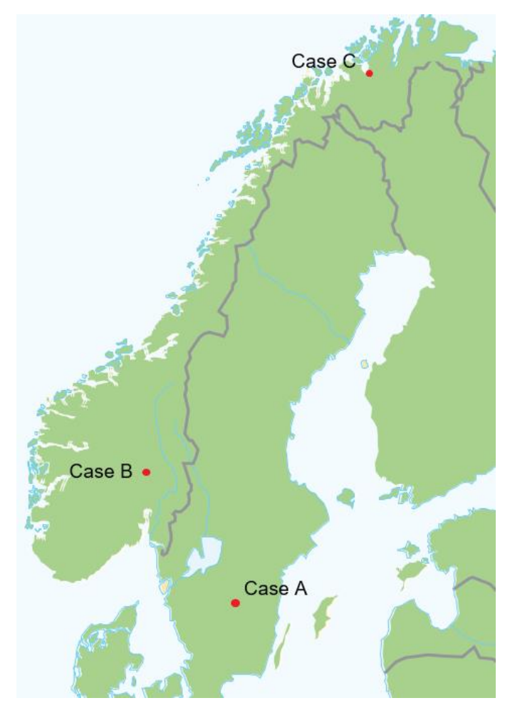
Figure 2. Location of the case universities

namely the "MSc in Sustainable Building Information Management" offered at Jönköping University. This case, hereafter referred to as case A, was purposefully selected as a case of extreme or deviant practice similar to what has been suggested by Patton (2014). Case A is deviant in that it represents a departure from established educational practice. The second case (Case B) is the "Digital Building Processes" MSc program taught at the Norwegian University for Technology and Science (NTNU) at their Gjøvik campus.