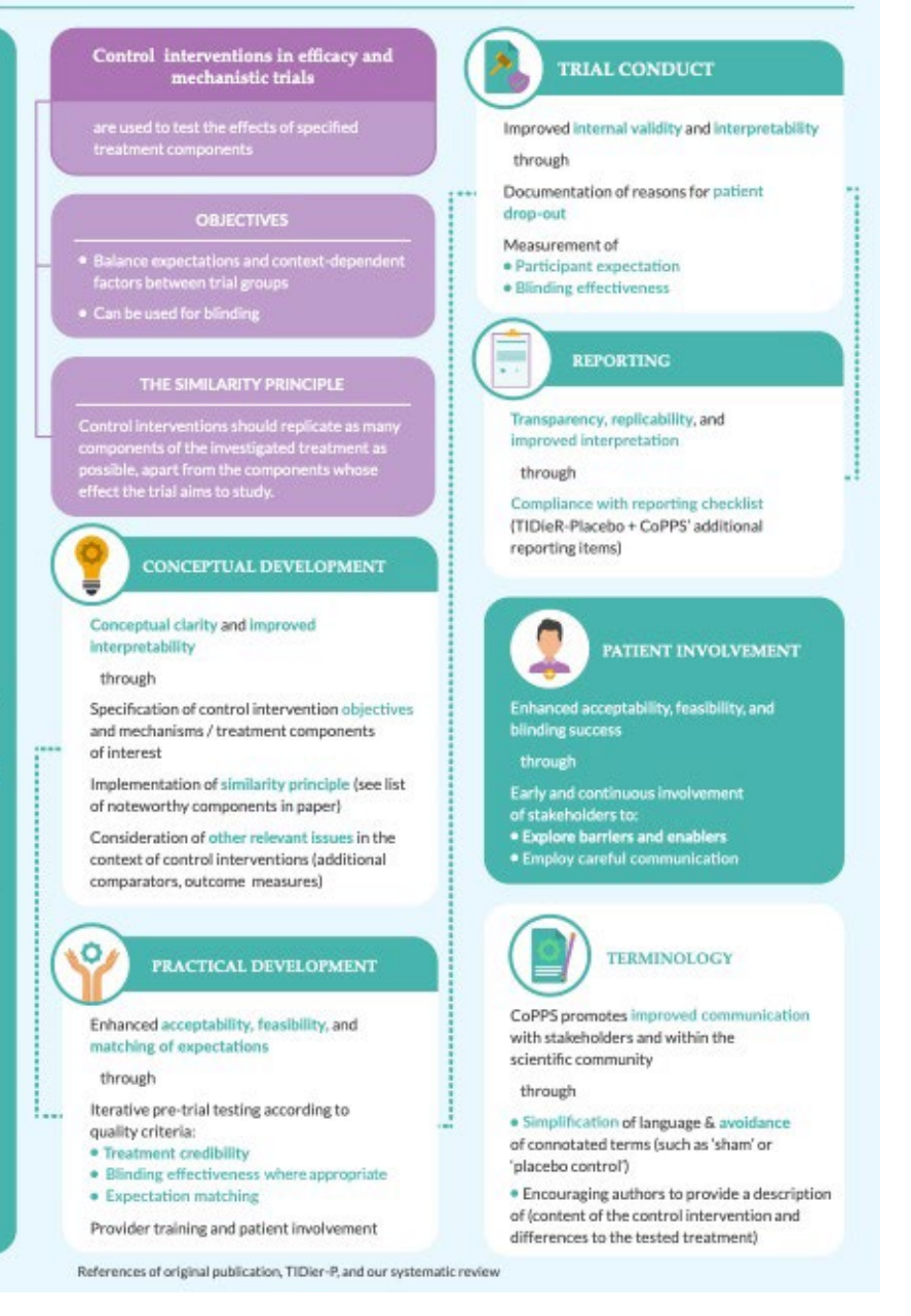
Figure 2: Graphical illustration of the CoPPS statement.