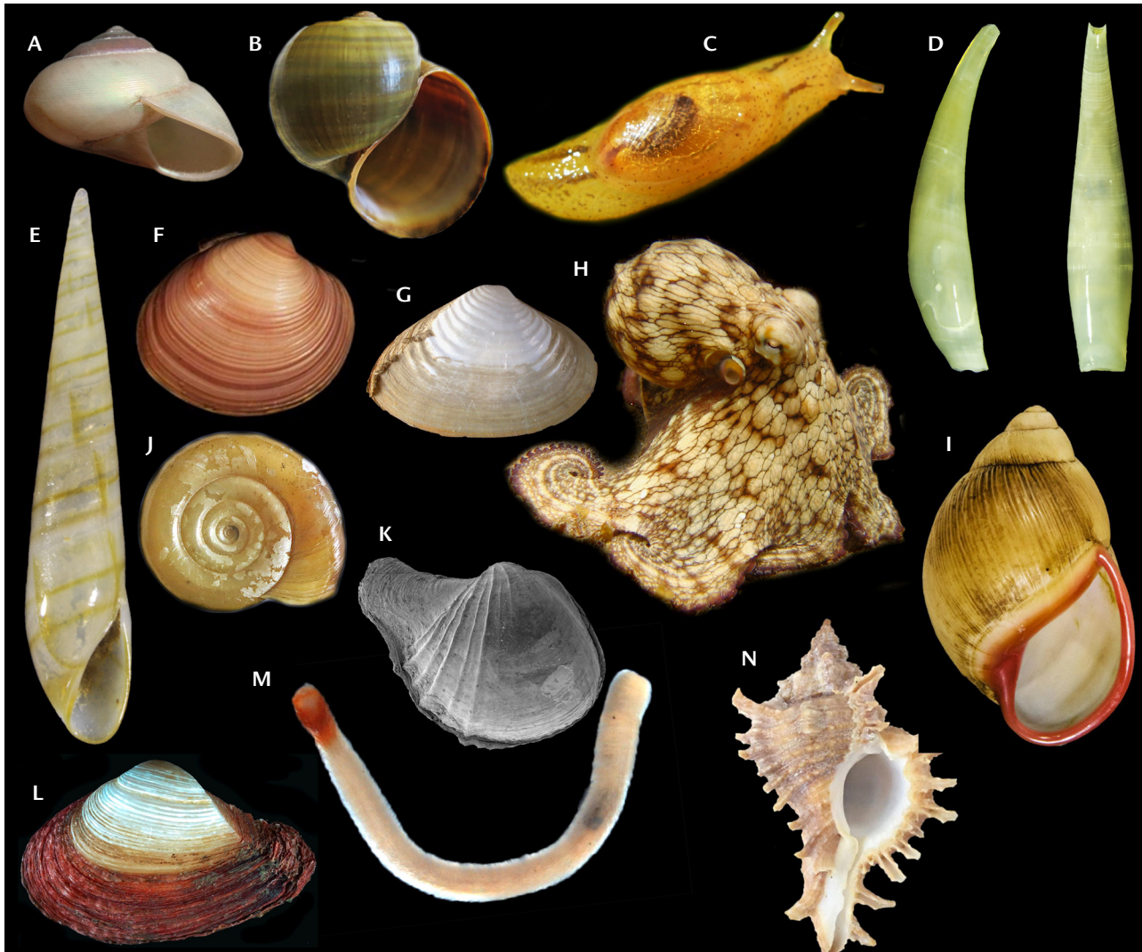
Figure 1. A small fraction of the diversity of shapes and colours of the Brazilian malacofauna: (A) Gaza compta Simone & Cunha, 2006, 19 mm long, marine gastropod, Margaritidae; (B) Pomacea maculata Perry, 1810, ~45 mm long, freshwater gastropod, Ampullariidae; (C) Omalonyx convexus (Heynemann, 1868), 2 cm long, terrestrial gastropod, Succineidae; (D) Gadila pandionis (Verrill & Smith, 1880), 11 mm long, scaphopod, Gadilidae; (E) Eulima bifasciata d'Orbigny, 1841, 8.1 mm long – marine gastropod, Eulimidae; (F) Eucallista purpurata (Lamarck, 1818), ~45 mm long, marine bivalve, Veneridae; (G) Mactrella janeiroensis (E.A. Smith, 1915), 27.7 mm long, marine bivalve, Mactridae; (H) Octopus insularis Leite & Haimovici, 2008, photo by C. Sampaio, ~80 mm long – cephalopod, Octopodidae; (I) Megalobulimus oblongus (Müller, 1774), ~118 mm long, terrestrial gastropod, Strophocheilidae; (J) Biomphalaria glabrata (Say, 1818), ~15 mm long, freshwater gastropod, Planorbidae; (K) Cardiomya minerva Lima, Oliveira & Absalão, 2020, 4.3 mm long, SEM image, marine bivalve, Cuspidariidae; (L) Corbula patagonica d'Orbigny, 1846, ~14 mm long, marine bivalve, Corbulidae; (M) Scutopus variabilis Passos, Corrêa & Miranda, 2021, ~12 mm long, aplacophoran, Caudofoveata; (N) Chicoreus brevifrons (Lamarck, 1822), ~40 mm long, marine gastropod, Muricidae.

microplastic pollution (Schaeffer-Novelli 1990, Migotto et al. 1993 Wang et al. 2021), trawling (Rogers et al. 2022), shell collecting (Zhang and Wu 2020, although that activity can