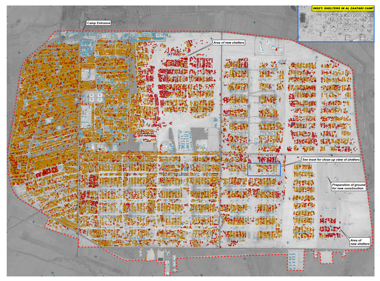
Fig.10 Al Zaatari Camp