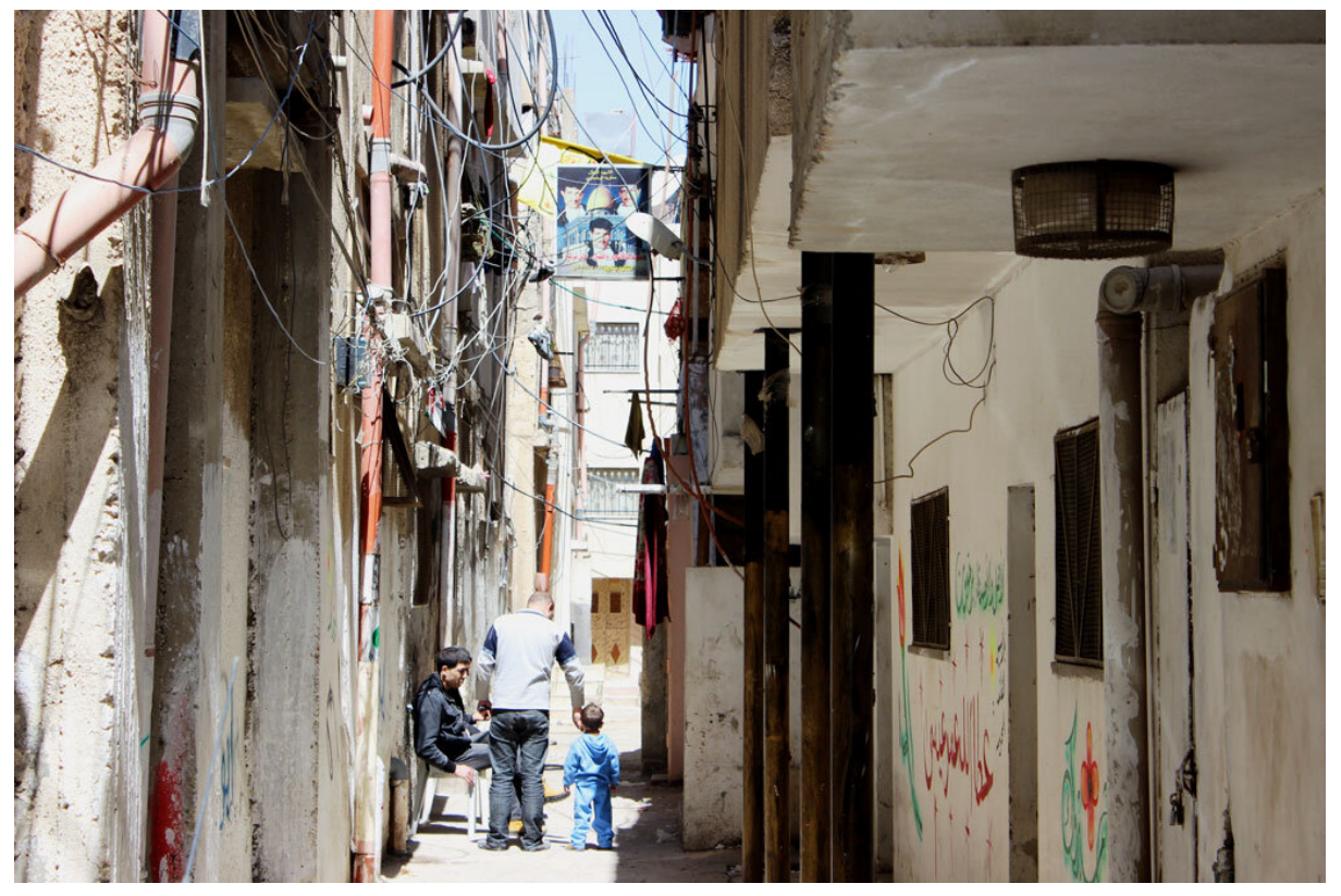
Fig.6. Balata Camp