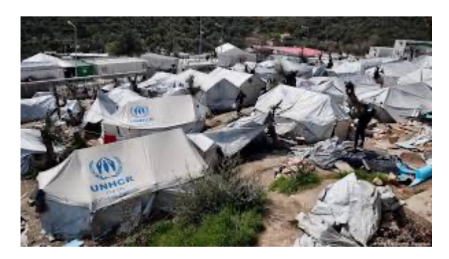
Fig.1. Moria Camp

2020) Moreover, many women were already victims of gender - based torture in their country of origin. Because of lack of proper lighting in the camp, and areas which are not separating men from women, they still feel insecure and endangered. <sup>104</sup>The social problem refugees faced in Moria 2.0 are lack of spaces for integration related activities. There are no places to "kill the time" or learn new things or exercise. UNHCR claims that there are educational activities but mostly outdoors and for small groups of children. However, small schools are organized mostly by refugees themselves.<sup>105</sup>