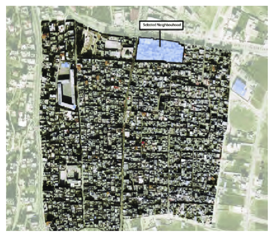
Fig.5. Balata Camp