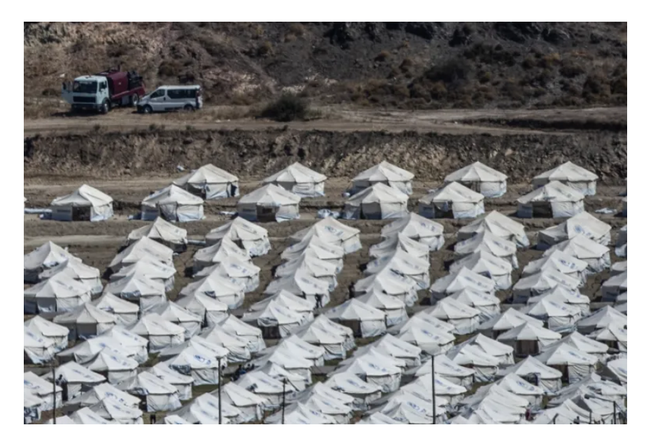
Fig.4. Moria 2.0. Camp