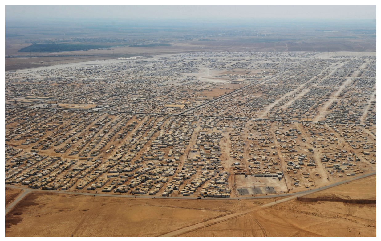
Fig.8. Al Zaatari Camp