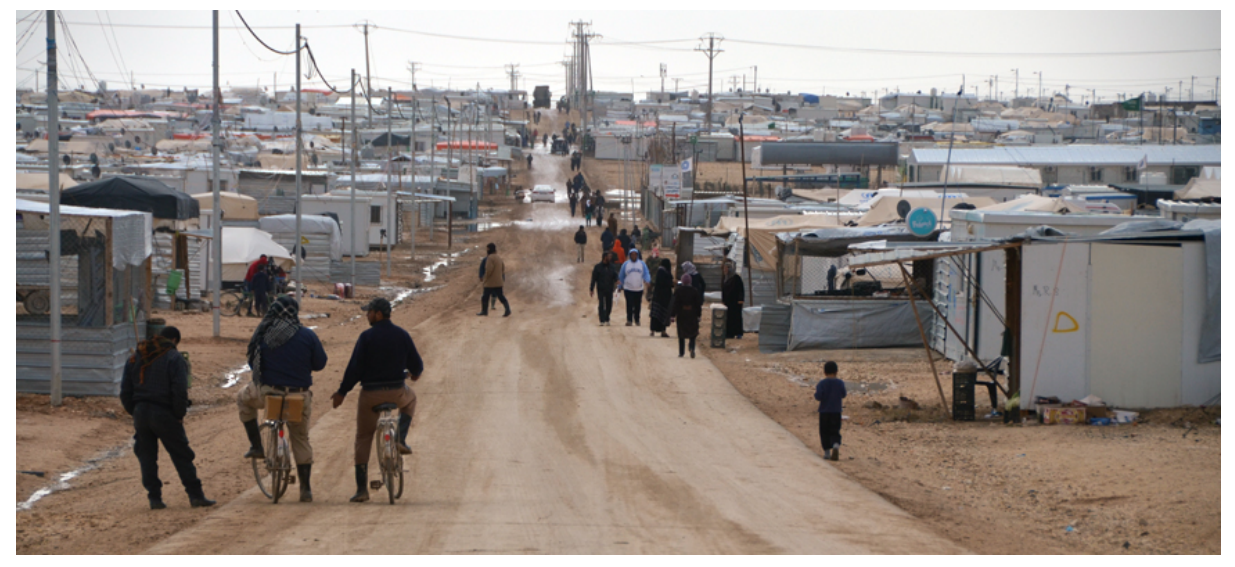
Fig.9. Al Zaatari Camp