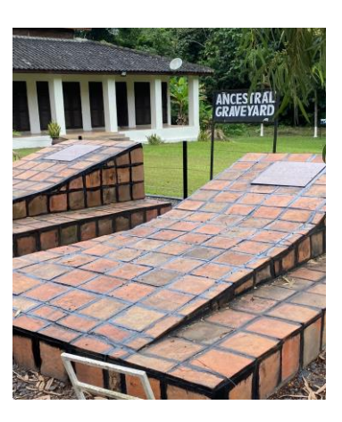
Figure 3. Assin Manso, Slave River site, and the Ancestral graveyard (Duane, 2021)

Similarly, two symbolic elements stand out for (AAF2), she took a Ghanaian name, and also purchased a kente cloth which symbolizes an element of identity change.