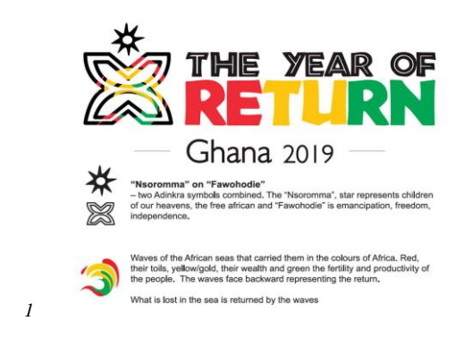
Figure 1. Year of Return Logo

The "Year of Return, Ghana 2019" is a prominent landmark spiritual and birth-right journey inviting the Global African family, home and abroad, to mark 400 years of the arrival of the first enslaved Africans in Jamestown, Virginia. The arrival of enslaved Africans marked a sordid and sad period when our kith and kin were forcefully taken away from Africa into years of deprivation, humiliation, and torture. While August 2019 marks 400 years since enslaved Africans arrived in the United States, "The Year of Return, Ghana 2019" celebrates the cumulative resilience of all the victims of the Trans-Atlantic slave Trade who were