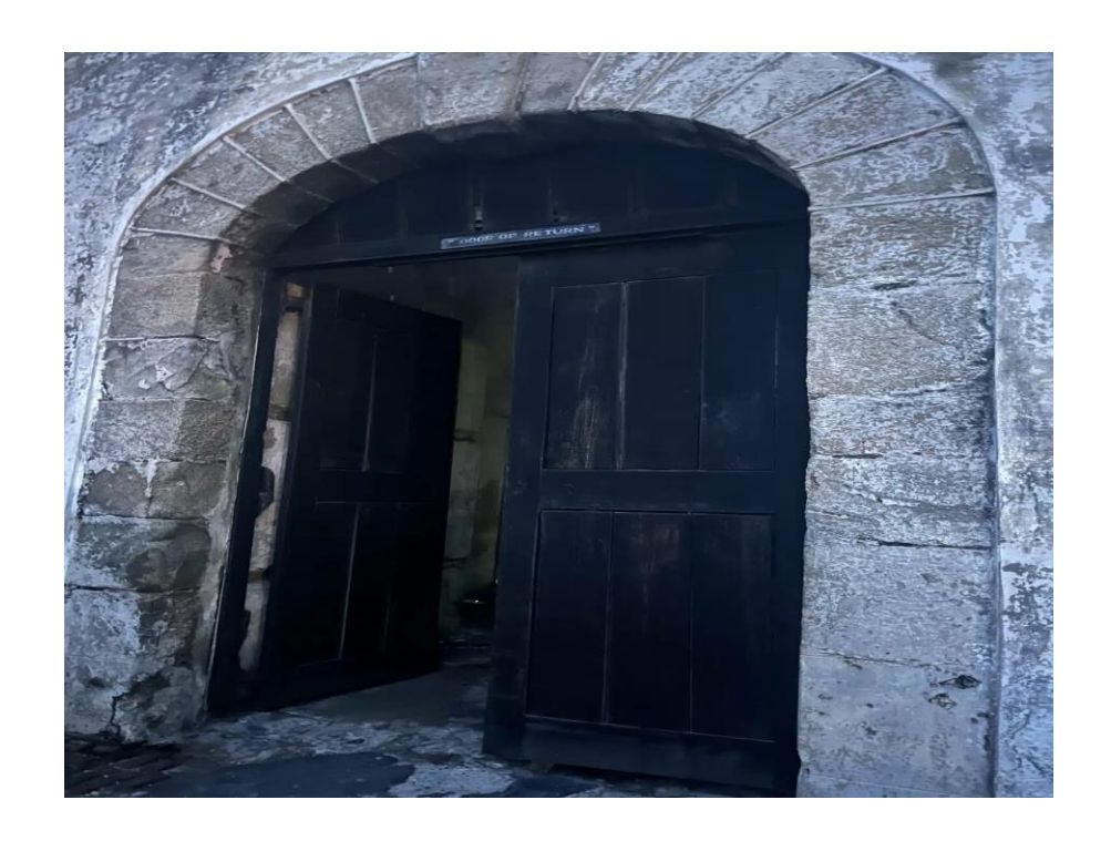
Figure 2. Image of the door of no return at the Cape Coast Castle, Cape Coast (Flynn, 2023)

Powers (2011: 1363) explores the diasporic public places where diasporic tourism takes place. The article reflects how place becomes the sphere of influence for identity formation for homeland tourists (Powers, 2011). Similarly, some important symbolic elements and places stands for the African-American in the narration of their tourism experience. one of such places is the door of no return.