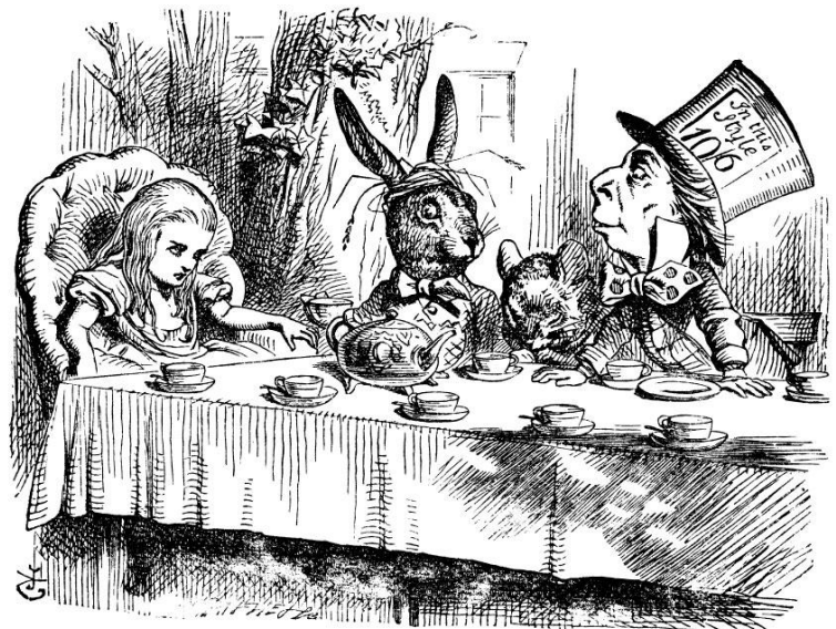
Illustration by John Tenniel, from Lewis Carroll's Alice's Adventures in Wonderland