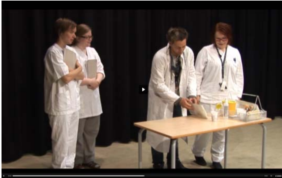
Figure 2: From the case of The Role of the Health Care Worker