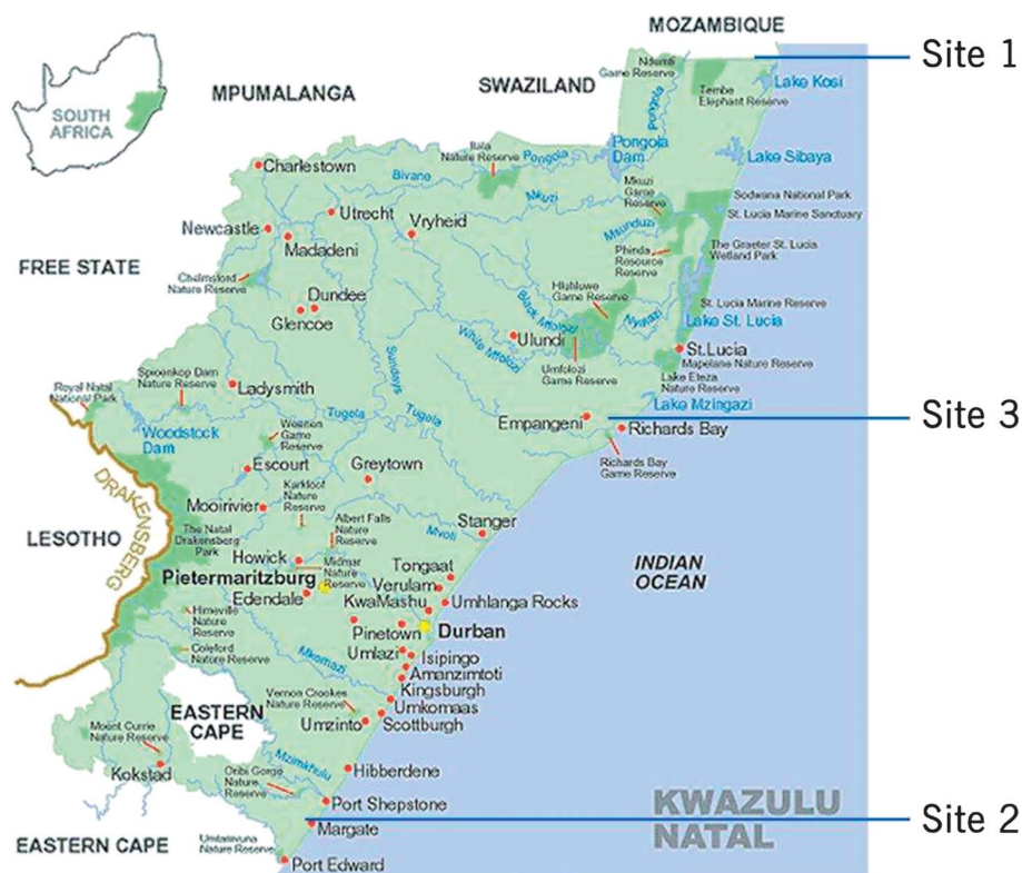
Fig. 1 Geographical positions of the study sites within KwaZulu Natal, South Africa.

analyses of \alpha -, \beta -, \gamma -HCH, endosulfan 1, endosulfan 2, HCB and the pyrethroids: cis -permethrin, cyfluthrin, cypermethrin and deltamethrin. All standard procedures were applied during sample collection and analytical procedures to avoid any contamination.