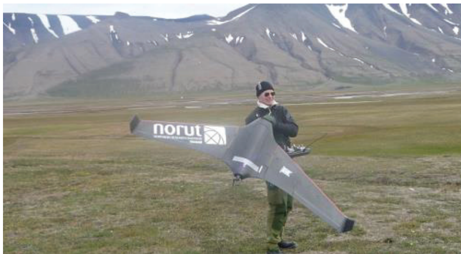
Figure 2: A fixed wing UAS used to measure NDVI over high arctic vegetation communities.

NDVI camera as for the S230 NDVI camera in order to avoid differences in measurements and to facilitate post processing. The community level measurements were taken 1.5 m above the surface, while measurements of the species level were taken 0.5 m above the surface.