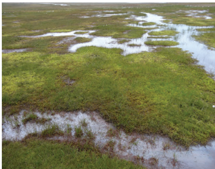
Figure 4: Fen with yellow-brownish coloured bryophytes (mainly Aulacomium turgidum ) and the graminoids Tundra grass ( Duportia fisheri ) and Arctic Cotton grass ( Eriophorum scheuchzeri ). This plant community was better separated in the RGB image than in the NDVI image.

sub-community levels within or between plant communities and vegetation types (e.g. the wet moss tundra and mires dominated by the mosses Aulacomium turgidum and Tomentypnum nitens and the sedges Carex saxatilis , Eriophorum triste and Eriophorum scheuchzeri ). The latter is also a challenge in the Landsat-based study of the study area (2).