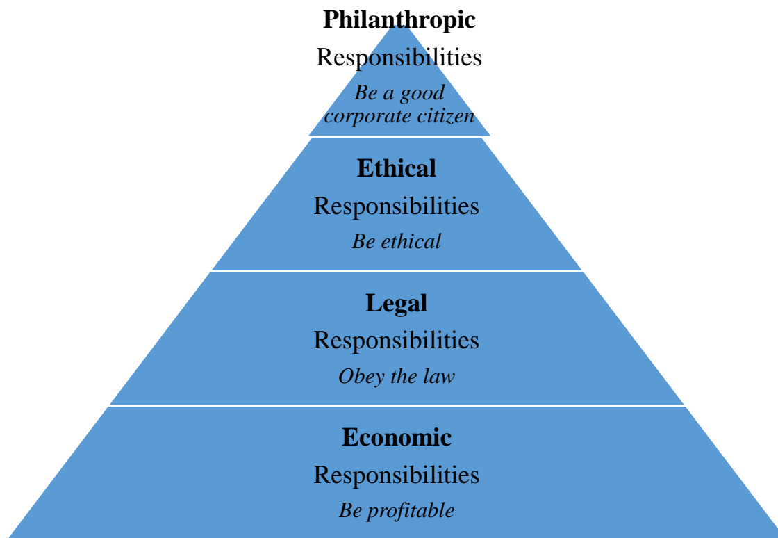
Table 1. CSR Pyramid