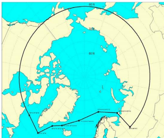
Figure 3: Maximum scope of Arctic waters application.

Navigational perspective of the “Arctic” area, IMO provides the definition of ‘Arctic waters’ in non-legally binding provision G-3.3 of the Guidelines for operating vessels in Polar Waters which is demonstrated in figure 3. 17 Meanwhile, in the other provision (G-3.5) “Ice-covered waters means polar waters where local ice conditions present a structural risk to a ship”.