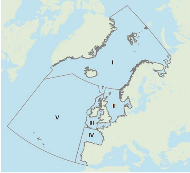
Fig.1 OSPAR maritime area. 96