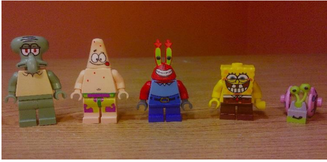
Figure 1. Introduction Slide