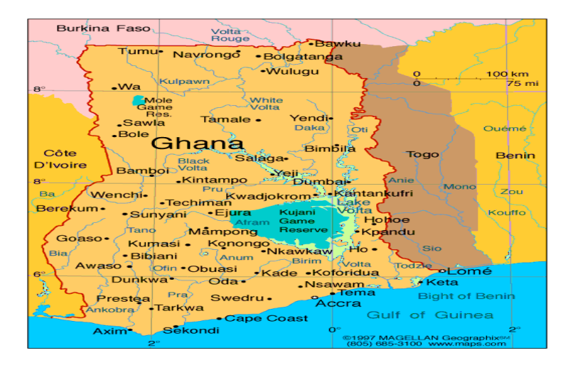
Figure 1; Map of Ghana showing major towns and countries it shares borders with.