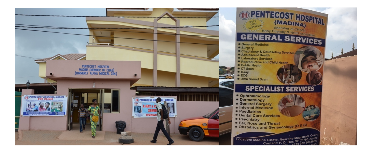
Figure 2: Directional chart and the gate of Pentecost Hospital