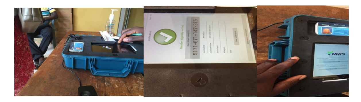
Figure 3. Observation on insurance validation claims at the hospital

Furthermore, during the time that I spent observing users at the OPD and the record department. I noticed how they are currently working with the introduction of the system, I watched their work routine; by reflecting my previous exposure to the routine flow of work prior the EHRs(HAMS). This was also supported with the interview which was done earlier about how working routine was before and after the introduction of the system. I further observed how they collaborated with other users from other departments. I got the chance to ask questions during these observations, to write down as much notes as possible about the activity and the discussions that were going on; at the same time wrote down the artefacts used, how they were used, by whom and in what situations. Hence lots of informal discussions were carried out.