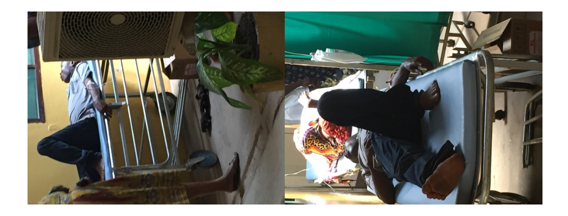
Figure 4. A photograph indicating patient was sleeping out unattended at the hospital contrary to responses made.

4.4.4 Reflections on the Data collection- The Researcher and his Role