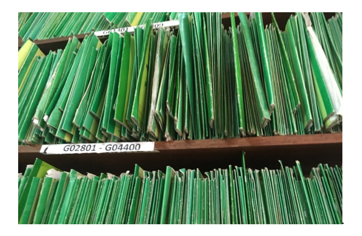
Figure 7. A figure showing folders still stored at the record department with the system in place

5.4.2 The Nursing Documentation; Unlike the Paper based record where the nurse manager each morning had to read the day and night report book to familiarize herself with the happenings at each of the wards, With HAMS she is able to access and summarize daily report by the close of work because she is able to supervise daily nursing interventions without compiling books to read later. These makes it easier for the manager to prepare monthly statistics on admissions, discharges, and the number of operations done, grouping them into major, minor and day cases which is forwarded to the Hospital Statistician.