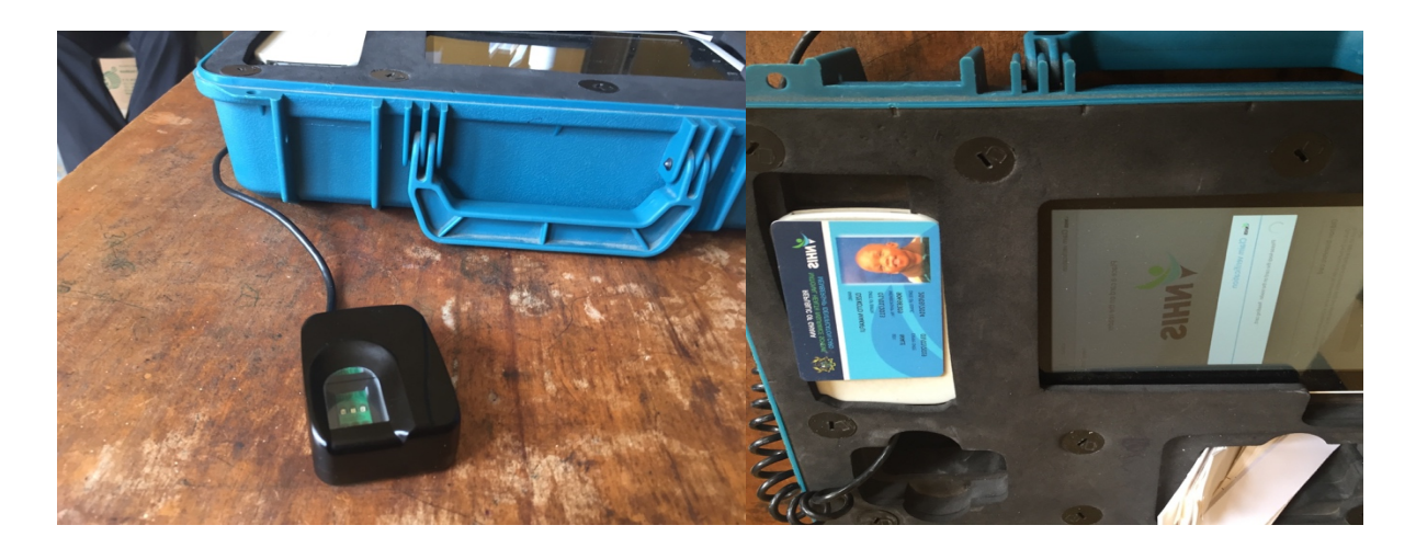
Figure 5. A figure showing the finger print verification for checking validity of insurance card

Afterwards, the patient is directed to the nurses who takes their vitals who document on the system the patient vital signs, basic symptoms treatments, new medication, and change of medication, nursing interventions, information on pending procedure, investigation, discharge and usually verbal orders given by medical officers on ward rounds and other nursing documentations required. This however varies whether the patient is an in-patient or outpatient. They do this by login in into the system with their unique user name and login