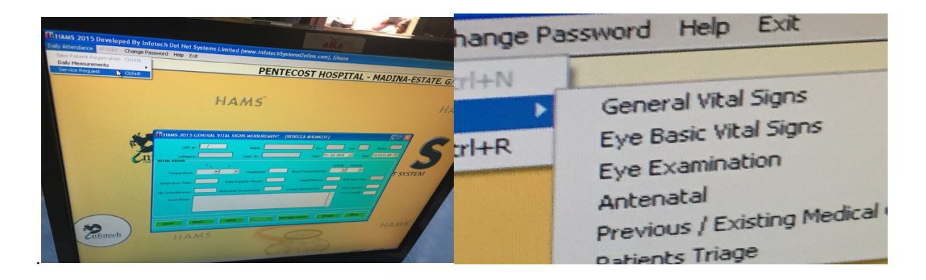
Figure 6. A figure showing some of the record taking at the ward upon the arrival of a patient.

However, with the in-patients not all the patient information is to be documented during the care processes, some are written in folders and submitted to the record department where the information is transcribed on the system. Normally, the nurse directs the patient to the available