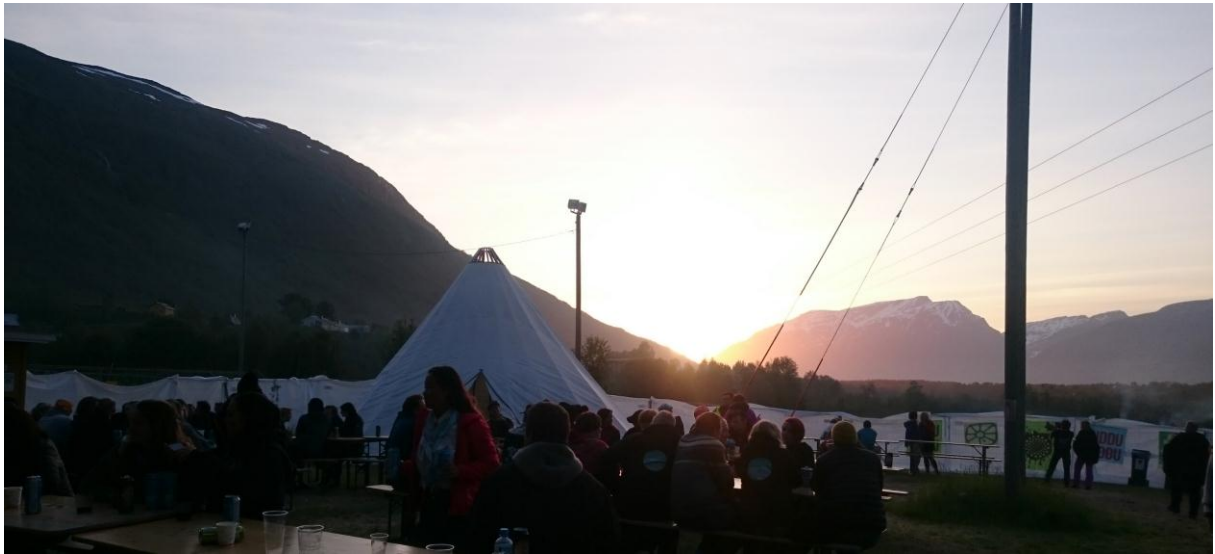
Figure 4: Audiences bidding the day goodbye. Riddu Ridđu Festival. July 2015

This music they came from or our algysh . These are very old songs, many years old. They are very good because we can feel it. Sometimes there are these melodies, words, mmm very good words, very nice melodies in these songs.”, (I, Koshkendey, personal communication, 9 July, 2015).