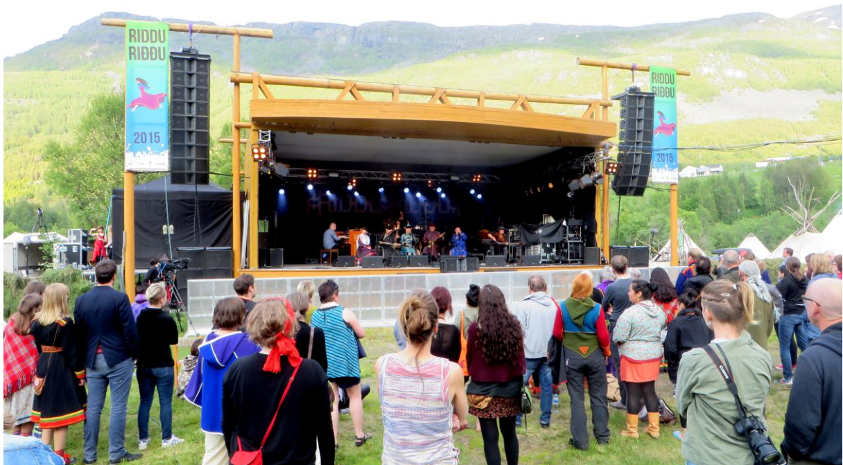
Figure 1. Collaborative Performance of Arvvas & Chirgilchin. Riddu Ridđu. July 2015

embody the felt experience through creative works such as music, art, and eventually those who experience these works also can feel these presences that artists experiences through encounters (as cited in Solomon, 1997). The festival is a space where indigenous musicians, artists and audience from around the globe can come together and celebrate their indigenous identity in solidarity through music and other forms of art. Therefore, Riddu Ridđu with its intense history of ethnic revitalization and cultural revival, definitely is a ‘contact zone’ where cultural actions happen (Hills, 2000) and a symbolic place where musical expression of Sámi and global indigenous identity come to life.