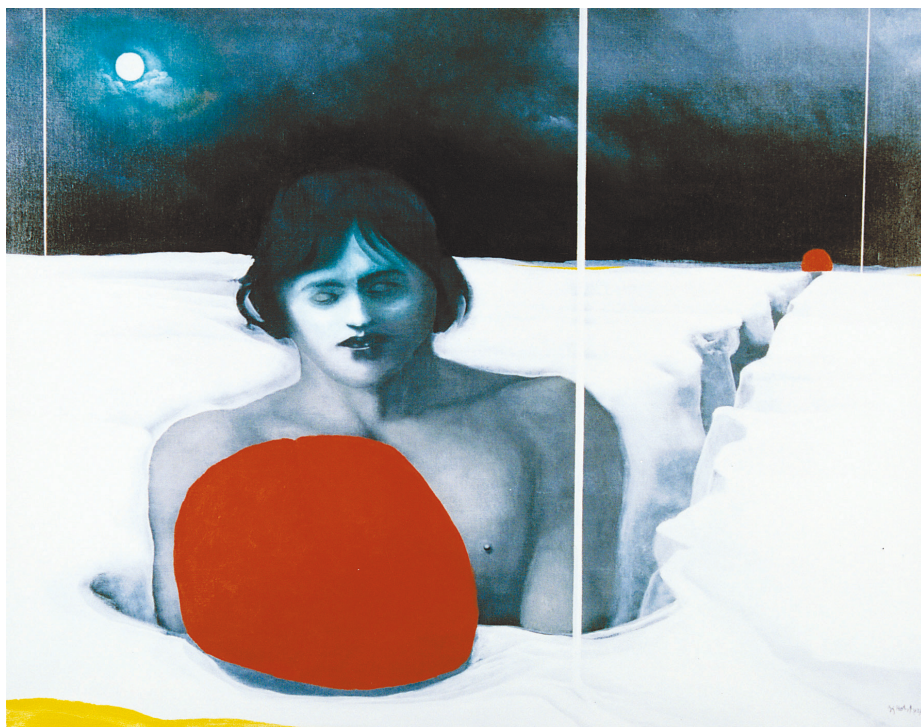
Bjarne Holst: Endymion, 1984, acrylic painting, 80 x 100 cm, Nordkappmuseet, Honningsvåg, Norway

of human emotions that ploughed their way into the imagining of northern Norway with Holst's remarkable achievement. Furthermore, the painting charts the icy climate for homosexuality and same-sex marriages at the time. 17 As the title suggests, the image also portrays the determinate love for any man of snow – the image implies obsession, fetish, and fixation. In all these respects, the haunting anthropomorphizing power of the painting imagines the many other communities in northern Norway, the soulscapes of all individuals who were not emotionally and legally included in the prevailing fabric of their immediate location, or their nation's. As such, Holst's visual art imagines the singular identities and belongings within community, a focus on the individual that Anderson's theories lacks, and Espolin Johnson's art often ignores.