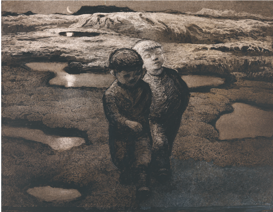
Kaare Espolin Johnson, Fylgje (Guardian Angel), 1949, lithograph, 39 x 53 cm, National Museum of Contemporary Art, Oslo, Norway

1979) and Lysbroen (The Light Bridge, 1986) , the dead at sea haunt the seascapes and the bereaved (Espolin Johnson and Arntzen 1994, 7, 23, 55). Religious leaders and sacred buildings are presented in the many portraits of Petter Dass and in the many motifs of the Boris Gleb community (G. Espolin Johnson 1997, 25–29, 140–141). Furthermore, several images place man in a random universe. Life is fragile, and the imbalance between human frailty and the sheer force of the elements is so immense that this disproportion produces metaphysical awe. Man is constantly overpowered, frequently to the point of death and beyond, by powers that appear mightier than their obvious physical force.