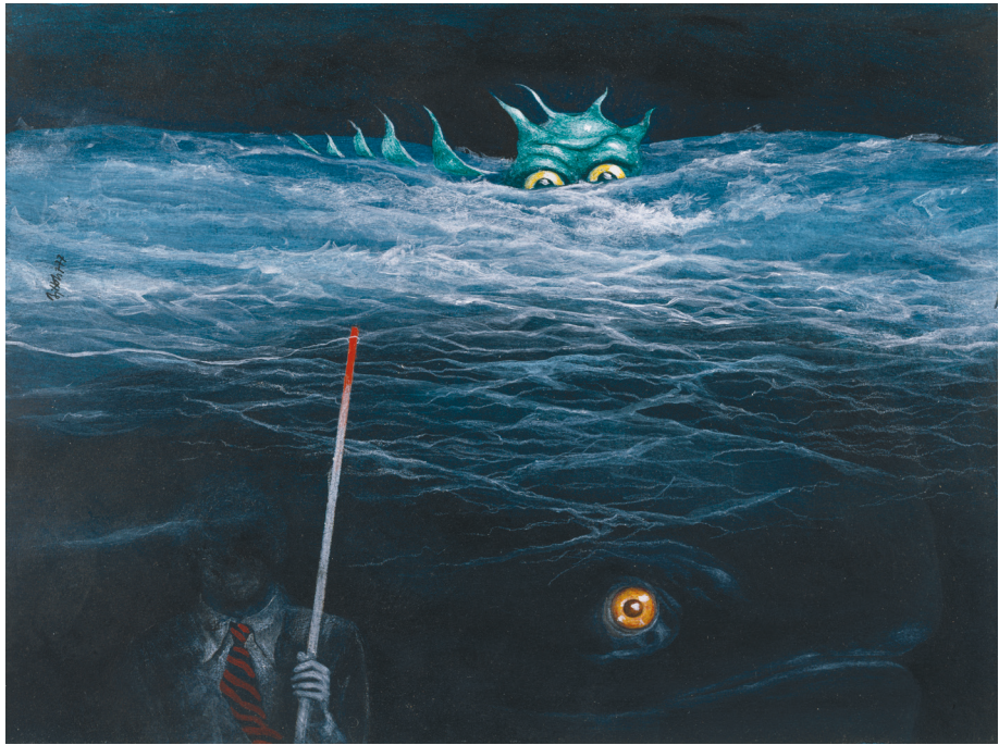
Trollfuglen i Gwais Kuns by (The Bird of Sorcery in Gwais Kun's City), 1977, acrylic painting, 24 x 32 cm, National Museum of Contemporary Art, Oslo, Norway

Parlek (Coupled Games, 1990–1991; Ljøgodt 2003, 34); Vintersang (Winter Song, 1980; Ljøgodt 2003, 44); Fløy en liten blåfugl (At Flight Little Bluebird, 1973; Ljøgodt 2003, 56); and I sykeværelset II (In the Sick Room II, 1975; Ljøgodt 2003, 57). These images and many others connect the anthropomorphizing aspects of Holst's art to emotional states between two people; often the personally unacknowledged socially suppressed, and morally forbidden passions and fantasies between them: the frozen forces of mind and self.