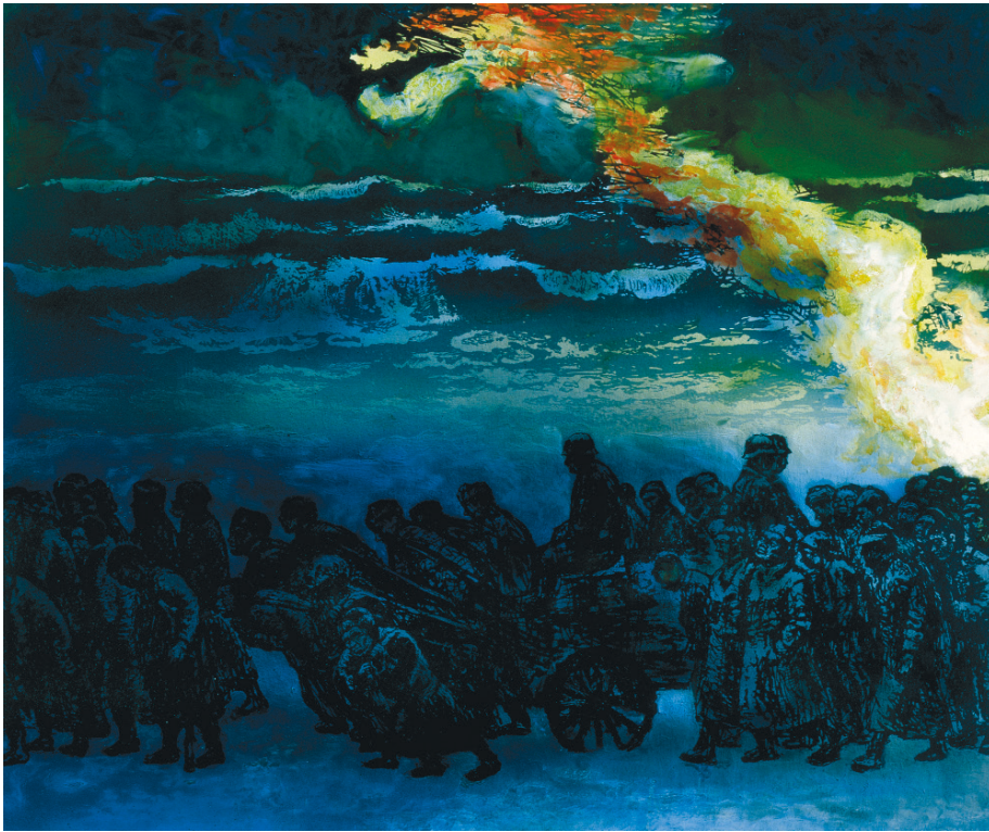
Kaare Espolin Johnson, Fangetog (Train of Prisoners), 1969, lithograph, 48 x 56 cm, Private, Galleri Espolin, Nyvågar, (BONO), Norway

the people, landscape, history, and anger that large parts of the population in northern Norway suffered during the last convulsions of the Second World War in Finnmark. In this illustration to Hølmebakk's Fimbulvinter (Hard Winter) , the exhausted Russian prisoners are driven like donkeys to facilitate the scorched earth tactics of the German withdrawal: they are exploited and dehumanized in the war machinery. The almost black and white imagery emphasizes the clear-cut opposition of good and evil, soldiers and prisoners, Germans and Russians, war and peace. Individual suffering and the clash of oppositional powers are integrated in the combat of indifferent elements that add cosmic scale to the scene. 14 The human convoy treads the earth under the dark sky, while the flames from destruction of war trail the train, and the ferocious sea appears to threaten them all. It is significant that Espolin Johnson focuses on Soviet prisoners in his images of war. This haunting commemoration also testifies to the humble compas-