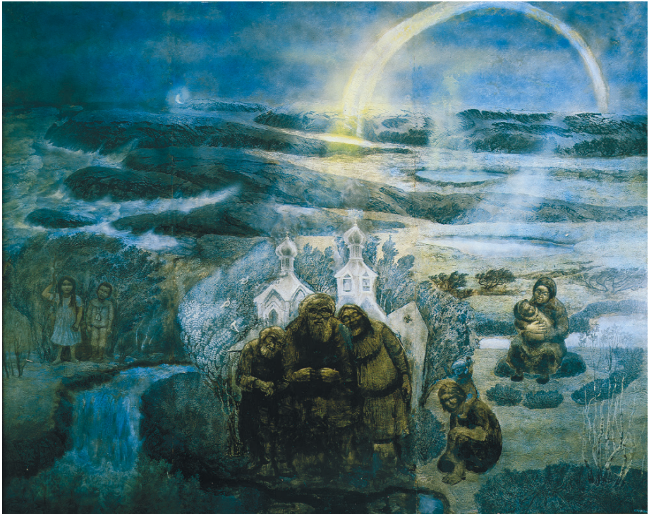
Kaare Espolin Johnson, Grenslandet (The Borderland), 1980, lithograph, 59 x 73 cm, Private, Galleri Espolin, Nyvågar, Norway