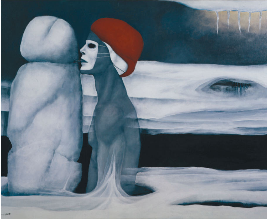
Bjarne Holst, Kjærlighet til en snemann (Love for a Snowman), 1988, acrylic painting, 60 x 80 cm, Private, Nordnorsk Kunstmuseum

duality of physical desire and spiritual interests, the gender battle of woman and man, the power struggle between wife and husband, the oppositions of nature and culture. A superimposition upon the couple's situation – husband and wife? – of the arctic nature creates an emotional topography beyond the physical and corporeal.