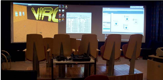
Fig. 3. Overview of the Visualization Center at UiT – The Arctic University of Norway

The test conductor as a local operator executed eight available robot actions and participant as remote operator sensed vibrotactile feedback. All the participants have executed the test one by one. They were not allowed to discuss experiences, while waiting in a separate room. When a participant entered the laboratory, he/she was greeted by the conductor and the goal of the test, the procedure and the capabilities of the system were described.