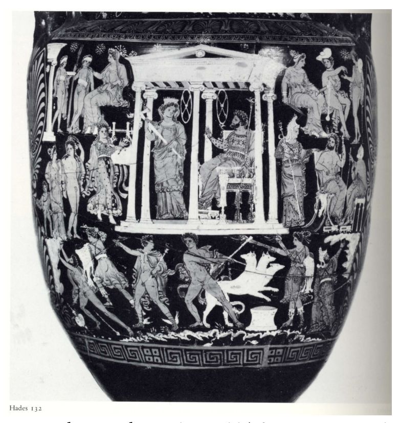
Fig. 2, Orpheus in the Underworld (after LIMC sv. Hades)