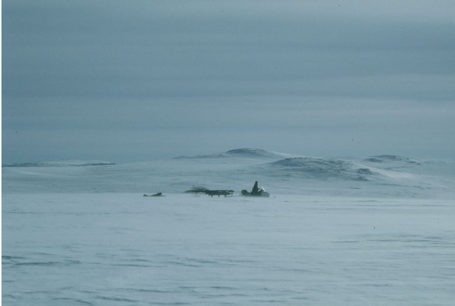
FIG. 4 - A Sami reindeer herder on his snowmobile on the tundra.

The assimilation policy in Norway, so called Norwegianization, stretches from about 1850 up to 1980 roughly. There are two critical and historical events that remarks on the Sami condition in Norway. The first one was when Storting (Norwegian Parliament) established Finnfondet (the Lapp fund) in 1851. This was a special item to make some changes in culture and language in the national budget. Second was the Alta controversy of 1979 – 81, which has already been mentioned in this text. This became a symbol to represent the Sami domestic movement against cultural discrimination and injustice carried out by the nation state. 103