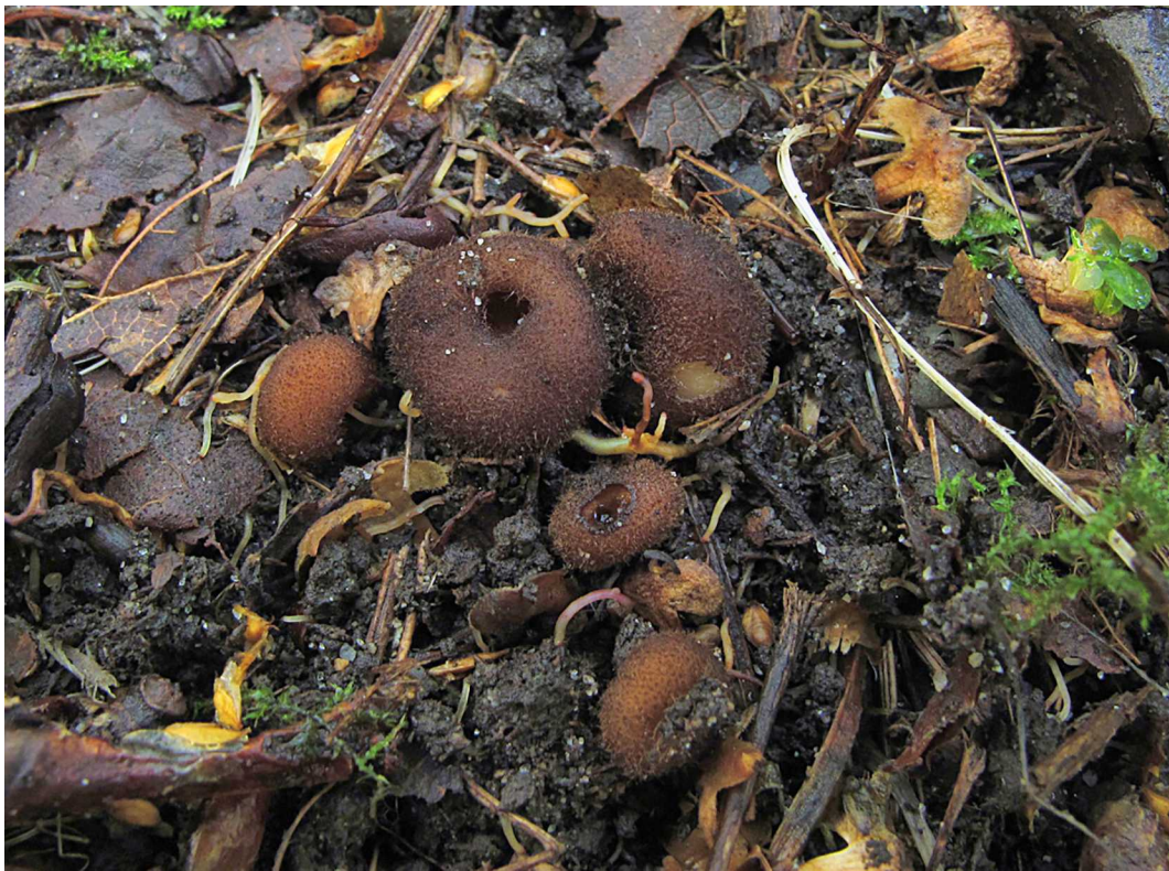
Figure 3. Ascomata of Genea hispidula (O-F-21106) photographed at the collection site in Rosnes-tangen (Moss) 1.9.2011.

Dermoloma cuneifolium (Fr.) Singer ex Bon (Vulnerable), and Limacella delicata (Fr.) Earle ex Konr. & Maubl. (synonym L. glioderma (Fr.) Maire).