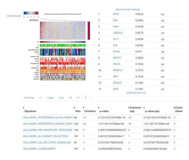
Figure 2: MIxT module overview page. The top left panel contains the gene expression heatmap for the module genes. The top right panel contains a table of the genes found in the module. The bottom panel contains the results of gene overlap analyses from the module genes and known gene sets from MSigDB.

The web application is hosted by a custom web server. This web server is responsible for dynamically generating the different views based on data from the statistical analyses and biological databases, and serve these to users. It also