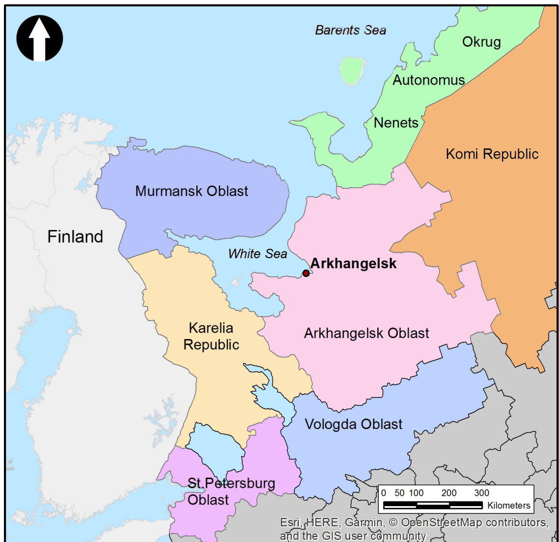
Figure 1. Map of Arkhangelsk County and neighbouring counties.

The research project described focuses on Arkhangelsk County (AC) and its administrative center, namely the city of Arkhangelsk. The latter was founded in 1584 and is located in the northwestern region of the Russian Federation. AC covers an area of 589,900 square km and had a population of 1,155,028 on January 1, 2018 [28], while the city of Arkhangelsk covers an area of 294,420 square km with 351,488 inhabitants in 2017 [28]. As shown in Figure 1, AC is in the Barents region and borders the White Sea, which separates AC from Murmansk County (Oblast). AC borders the counties of Vologda and Kirov, the Republics of Karelia and Komi and the Nenets Autonomous District.