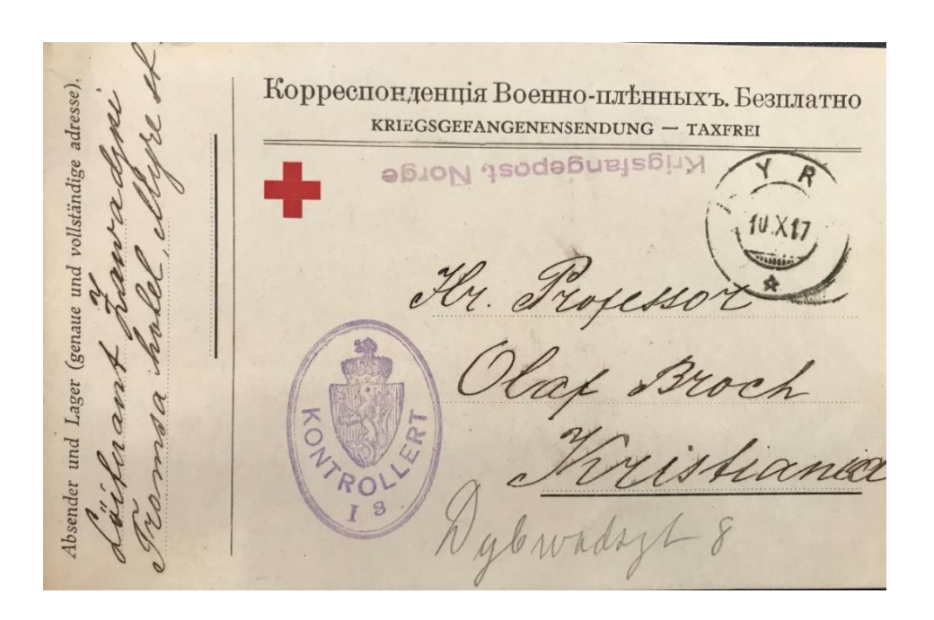
"Checked" (NB, Brevs. 337, Ureg.)