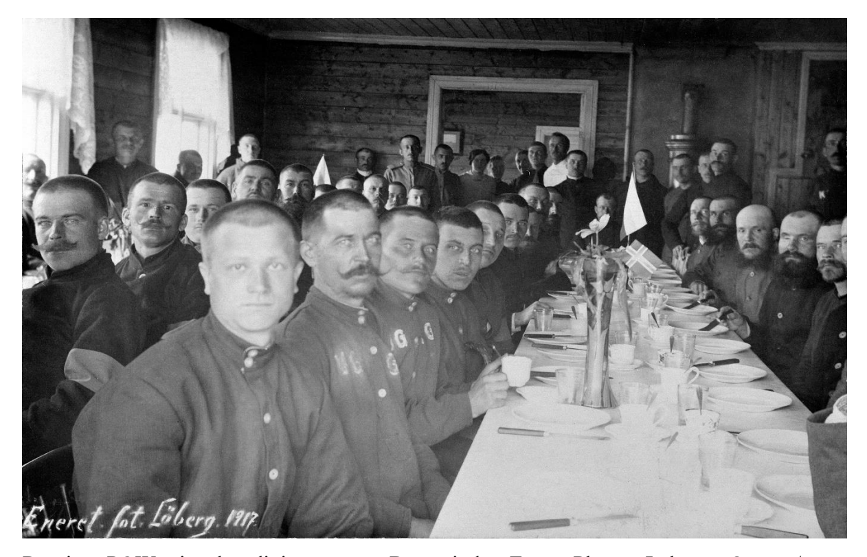
Russian POWs in the dining room, Baneminde, Espa; Photo: Løberg, Oscar / Digitaltmuseum- Anno Domkirkeodden

https://digitaltmuseum.no/011012787288/interior-baneminde-pensjonat-spisesalenrussiske-krigsfanger-espa-under (last accessed 05.03.2019)