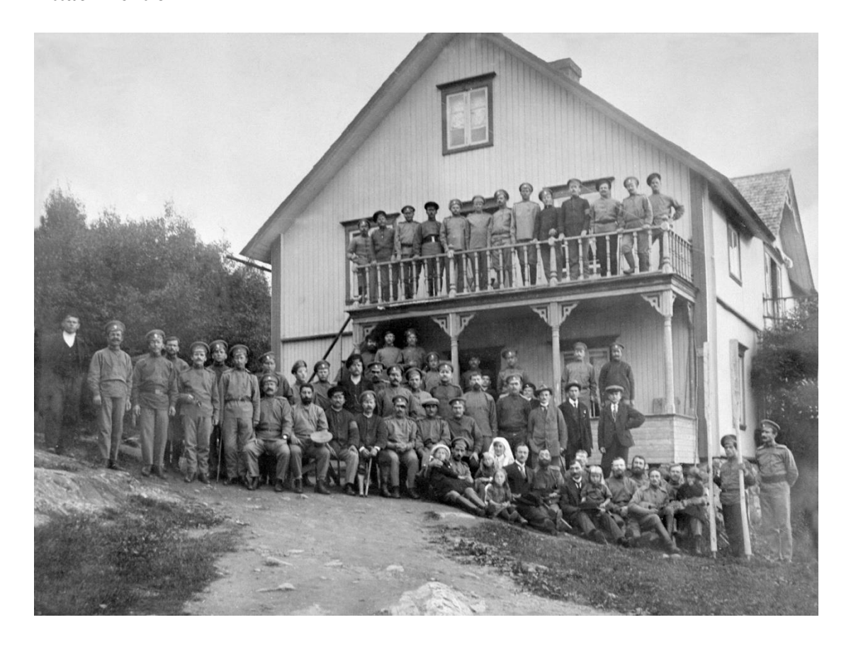
Russian POWs Baneminde, Espa; Photo: Unknown / Digitaltmuseum- Anno Domkirkeodden

https://digitaltmuseum.no/011012780658/baneminde-stor-gruppe-russiske-rekonvallesenter-espa-under-1-verdenskrig (last accessed 05.03.2019)