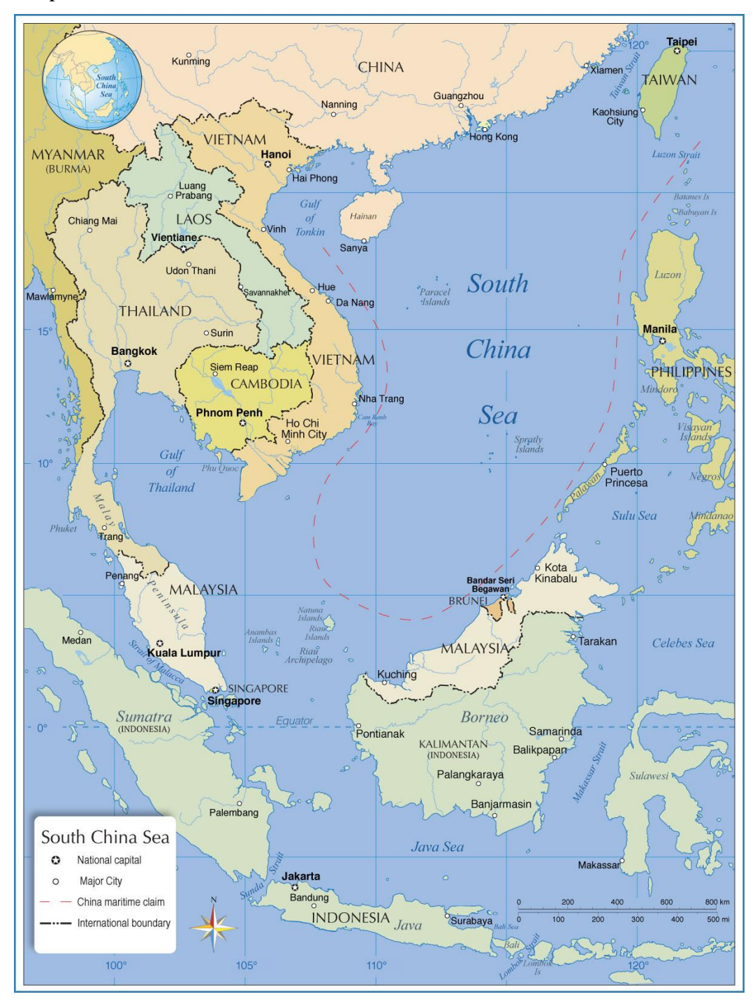
Map of South China Sea with Coastal States.