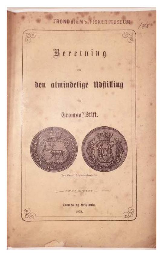
Fig. 3. The Account of the General Exposition for Tromsø Diocese (1872).

visiting Fandrem in Komagfjord was because it gave access to Liidnavuotna "where a lot of Sea Sami live" (Tromholt 1885:488).