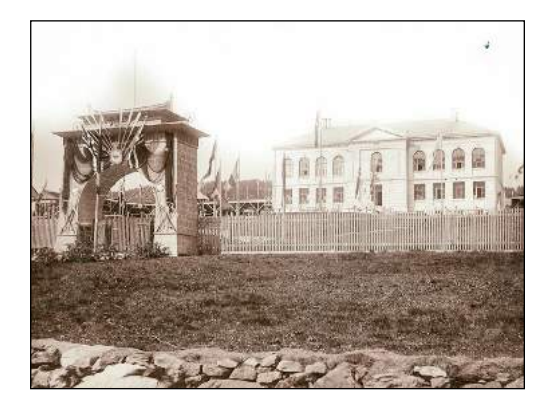
Fig. 6. The General Exposition 1894. The new museum building and the exposition portal. Photo: Hedley With. Perspektivet Museum.