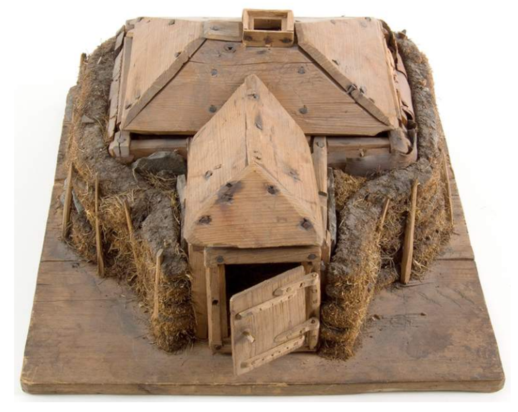
Fig. 9. L2359 Sámi ethnographic collection, Tromsø University Museum. Model of double Sea Sámi turf hut. Made by «Sjur Olsen Korsfjord Talvik».