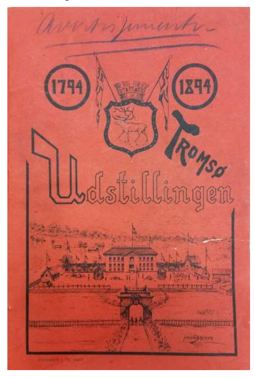
Fig. 7. Tromsø Udstillingen. Catalogue.