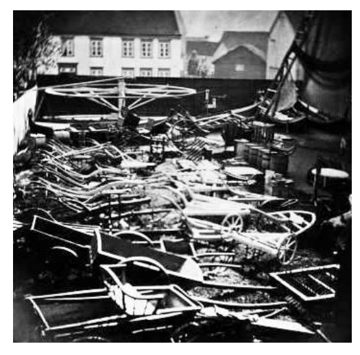
Fig. 2. The General Exposition 1870. The somewhat chaotic display, mainly of boats, in the backyard of Hotel du Nord. Tromsø University Museum.

The Tromsø Stifstidende newspaper ran a series of detailed reports on the exposition until it closed on the sixth of October. It was probably symptomatic of the large public interest that the Sámi department was the focus of the very first report. Details regarding the Sámi department were also reported in The Account of the exposition. Indeed, more than a quarter of the 162-page long account is devoted to the Sámi department. The catalogue presented the announcement of the exposition in North Sámi and explained many Sámi words (Beretning 1872:119). In comparison, the catalogue for the 1894 exposition was 61 pages long and did not contain a single Sámi word or term. The circumstances seem to reflect an interest in language diversity and the