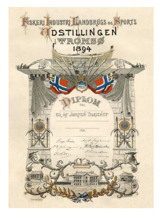
Fig. 5. The General Exposition for Fisheries, Agriculture and Industry. Diploma. Tromsø University Museum.

Fourteen years later, in 1894, a new exposition was presented in Tromsø. While this exposition differed from the first in many ways, one of the most interesting features was that the Sea Sámi no longer formed a part of the display. Instead, the focus was exclusively on the nomadic reindeer herding Sámi culture. While a negative attitude had gained footing in the dominant society regarding the Sámi as a whole by this time, the Sea Sámi were often portrayed as if they were on the lowest rung of the social status ladder. Both developments were in accordance with the changing attitude in the culture of the time, from an exoticism informed by universalism