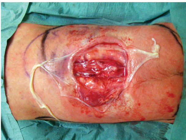
Fig. 2. Autologous amnion is used as a dural graft with its epithelium side placed to the spinal cord and adapted to the defect.

the underlying chorion by mechanical peeling (Fig. 1). The newborn had spontaneous leg movements. Within 24 hours, she was operated on for her hydrocephalus and MMC. An Ommaya reservoir was placed to reduce intracranial pressure. The placode was carefully separated from the dysplastic and rudimentary meningeal tissues, and dysplastic skin was excised. A SCM was diagnosed at the level of the placode. It was decided not to excise the bone spur. Autologous amnion was used as a dural graft. The graft was sutured in place with its epithelium side toward the spinal cord (Fig. 2). A tension-free closure of the CSF compartment was obtained. The neural repair was covered with a thoracolumbar fascia followed by another autologous amnion layer and a sensate medial dorsal intercostal artery perforator flap (Fig. 3). Postoperatively, CSF was withdrawn for the Ommaya reservoir on a daily basis to prevent a high CSF pressure. No CSF leakage occurred in the postoperative phase. A minor wound dehiscence developed. After 1 week, a ventriculoperitoneal shunt was placed, and a minor wound revision was performed. The postoperative course was