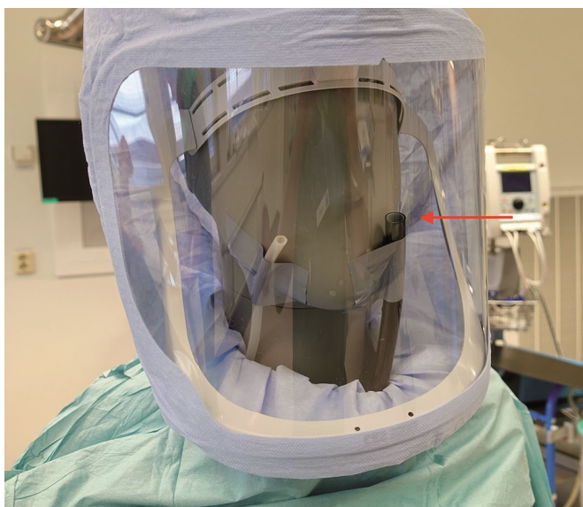
Figure 1. Test setup. The dummy with helmet, hood, and gown in the test setup. Arrow indicating particle counter inside helmet. (White probe is a passive pressure probe not used for tests reported in this paper.)

air impermeable. The original purpose of surgical helmets was to protect patients from particles that the surgical team might emit into the wound. Additionally, surgical helmets will protect the surgeon from direct body fluid contamination.