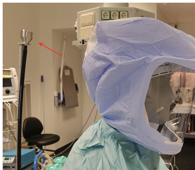
Figure 2. Test setup. Arrow indicating particle counter outside helmet.

The investigation was performed in an orthopedic operation theatre at Sahlgrenska University Hospital, Gothenburg, Sweden. The theatre is equipped with a mixed ventilation system that meets SIS-TS 39:2015 requirements and is audited annually (Swedish Standards Institute 2015). A Stryker Flyte helmet (Stryker Instruments, Kalamazoo, MI, USA) with the standard hood (Flyte Hood, product no. 0408-800-000) was mounted onto a dummy with head and torso. A standard surgical gown (Barrier Surgical Gown Classic, Mölnlycke, Sweden) was tightened around the neck. A 6D Laskin nozzle aerosol generator (Air Techniques International, Owings Mills, MD, USA) generated an oil-based hydrogenated 1-Decene homopolymer (PAO-4) test aerosol. The generator was active for approximately 15 seconds at the start of each test. A particle counter (Solair 3100, Lighthouse, Fremont, CA, USA) detector probe was fastened to the nose of the dummy (Figure 1).