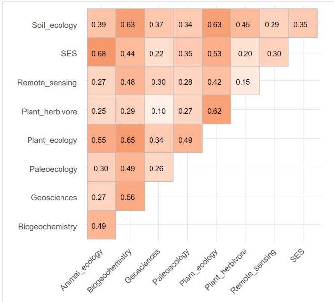
Figure 2. Cosine correlation matrix between the disciplines. Darker colours represent higher cosine correlations.