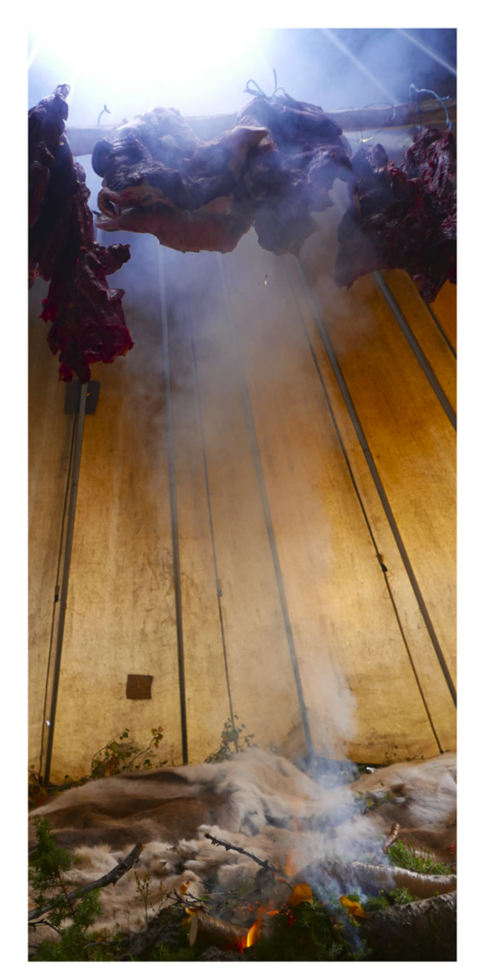
Fig. 4. Sami traditional meat smoking with birch and juniper in a lávvu (Sámi tent).

traditional knowledge is local knowledge, unique to its given culture. Traditional knowledge often combines knowledge and practices to give a holistic understanding of human interaction with their surroundings (Nakashima & Roue, 2002). Reindeer herding is a complex human-coupled ecosystem (Magga, Mathiesen, Corell, & Oskal, 2011), and traditional knowledge is embedded in complex networks of social relations, values, and practices (Nadashy, 1999, p. 5).