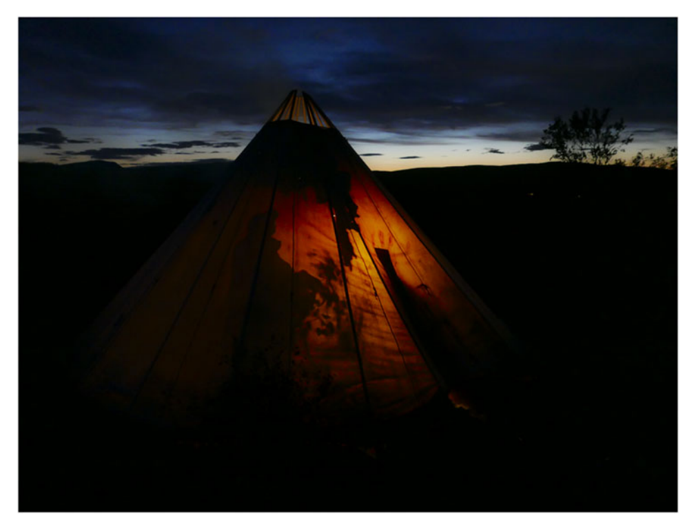
Fig. 1. reindeer herder smoking reindeer meat in a traditional Sámi tent-the lávvu.

may be lost if essential knowledge is excluded, we finally argue for the necessity of including traditional knowledge in future studies of traditional practices.