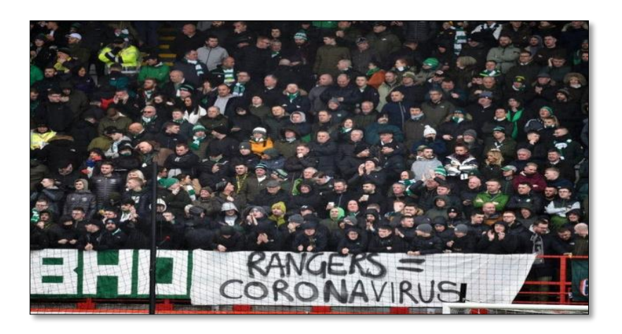
Figure 3 "Celtic fans taunt Rangers at Hamilton clash." (Oates, 2020)

identity is Scotland. The song is regard as highly offensive, but both sets of fans always look for ways to provoke each other with songs, chants or symbols even when they are not playing each other.