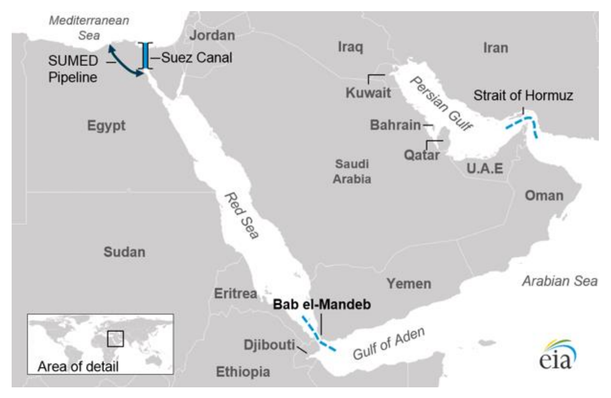
Map of the Waterways around the Arabian Peninsula

At its narrowest point, between the coasts of Djibouti and Yemen's Perim Island, the Bab el-Mandeb includes Djibouti's Seven Brothers Islands (also referred to as Sawabi or Seba Islands). Djibouti has connected these small islands with its system of straight baselines (Djibouti's 1985 Decree). The longest straight baseline segments, respectively about 6.5 NM and 10 NM long, connect the islands of Ounda Komaytou and Kadda Dabali with Djibouti's mainland coast (Marineregions.org). The internal waters regime applies within the limits of the straight baselines around the Seven Brothers Islands (Art 8 of LOSC), but this does not have much significance for the passage regime in the Bab el-Mandeb. The international vessel traffic that follows the traffic separation scheme (TSS) in the Bab el-Mandeb runs northwards of the Seven Brothers Islands through the territorial sea of Djibouti and Yemen.