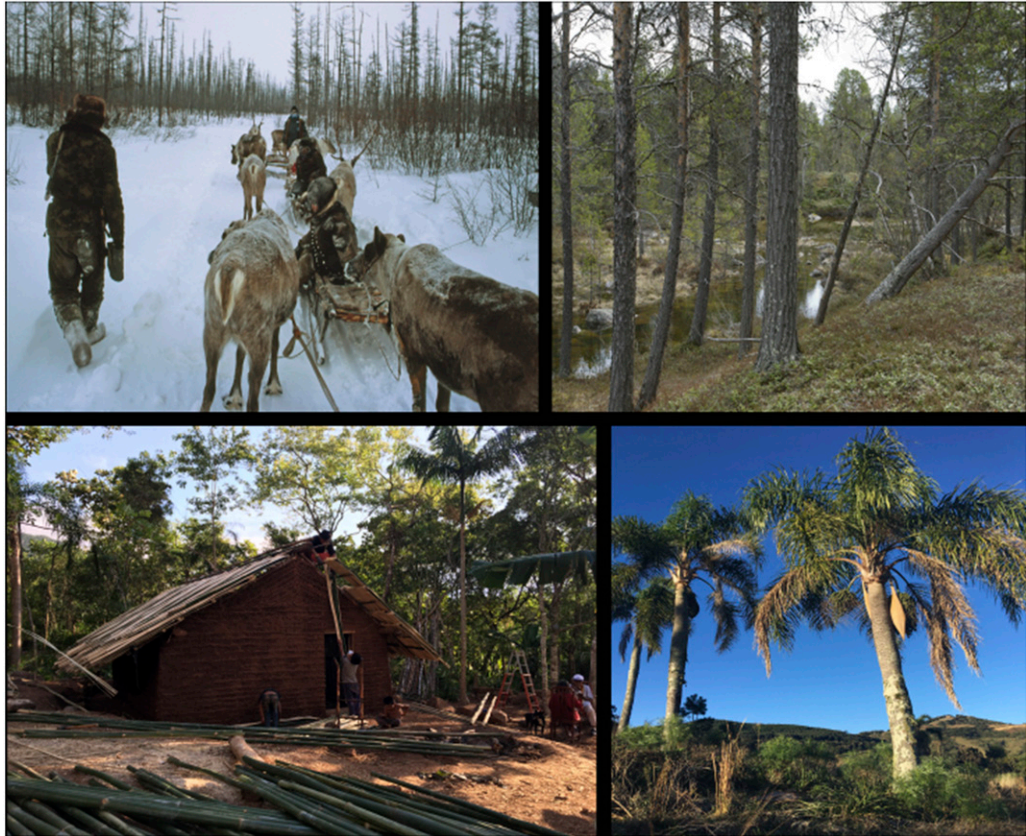
Indigenous and traditional cultures and languages are the backbone of biodiversity conservation across the globe. Nonetheless, the rich knowledge found in these languages and cultures is not used in standard monitoring or conservation projects, and they face constant perils from parts of society with economic and political power. (Top Left) Evenki reindeer herders, Russia. (Top Right) Skolt Saami old growth forests Finland. (Bottom) Guarani community and local ecosystem vegetation, Brazil.

species present in the Kawawana ICCA are considered as sought-after commodities and are used in traditional ceremonies.