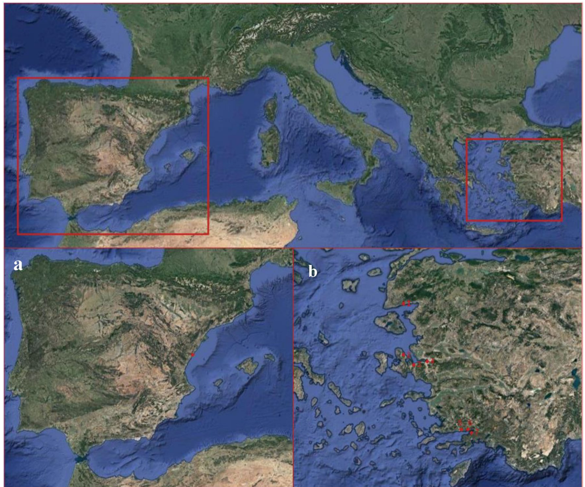
Figure 3. (a) Castelló de la plana's location; (b) Fishery cooperatives data collected in the Aegean Sea: (1) Altınoluk, (2) Mordoğan, (3) Urla, (4) Bostanlı, (5) Akbük, (6) Akyaka, (7) Akçapınar.

Community (Fig. 3a). This region is characterized by a well-defined seasonality with relatively cold winters and hot summer periods, and this gradient marks the distribution of the fish species and their exploitation patterns. The most recent climate change is changing the “traditional” geographic distribution patterns of the fishes in the area 61 . In the western Mediterranean, the fishing fleets are heterogeneous and the fishing activity depends on multiple species, and many fishing fleets have adopted measures to ensure the sustainability of the fishery resources. For example, maximum daily/weekly catches (purse-seine fleet) or fishing 4 days per week (Trawling fleet).