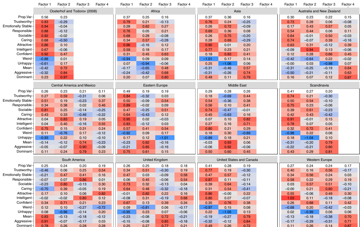
Fig. 2 | EFA loading matrices for each region. Positive loadings are shaded red and negative loadings are shaded blue. Darker colours correspond to stronger loadings. The proportion of variance explained by each factor is included at the top of each table.

Our study is one of several recent studies that have begun to utilize different statistical models and to explore more dynamic theories of trait ratings 21,29,30 by exploring how the structures of trait ratings vary systematically. This growing body of work catalogs variations in trait ratings by target demographic 21,29,31 , target status 32 , target age 33 , perceiver knowledge 34 and cultural factors 17,18 . Furthermore, this growing body of work proposes dynamic theories of person perception and more flexible statistical models for capturing them 21,29,30,35 .