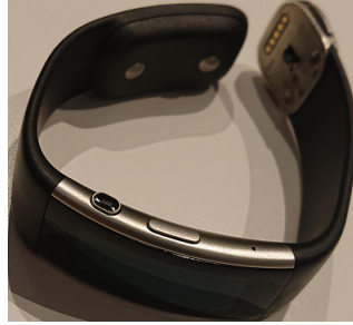
Fig. 1. Wrist-band watch.

An in-house developed app was programmed to collect the data. The app runs on the Android operating system. The user interface consists of a dropdown list from which the subject can select the home-task. The wrist-band transfers the captured sensor data and timestamps over Bluetooth to the smartphone. All the inertial data is stored in a plain text format.