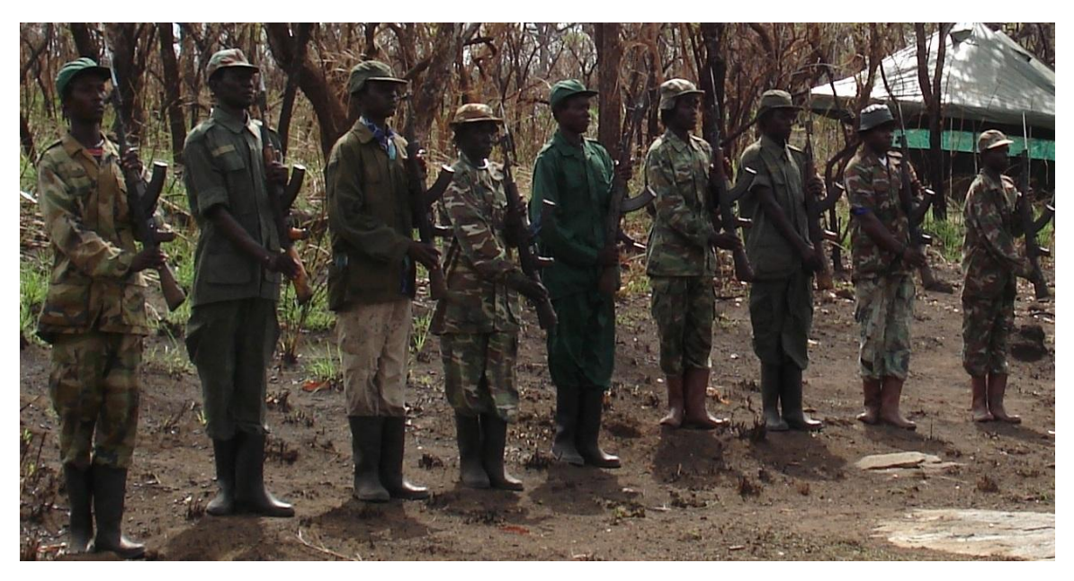
Figure 3 Showing LRA abducted child soldiers in combat