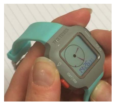
Figure 5 Time timer wristwatch with analogue and digital modes

The Time timer wristwatch has two functions that were used during the intervention: 1) Time shown in analogue and digital modes (Figure 5) and 2) Countdown function (Figures 6 and 7). The teachers chose to set the countdown at 15 minutes, and organised activities on this basis. The pupils could start the countdown with one click. At the start, there was a full red circle (Figure 6), but as the countdown proceeded, the red lines gradually decreased (Figure 7). This function was used when the pupils were to read, work at their stations, or work with assignments individually or in groups.