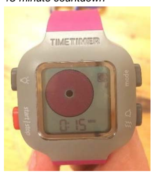
Figure 6 Time timer wristwatch with 15-minute countdown