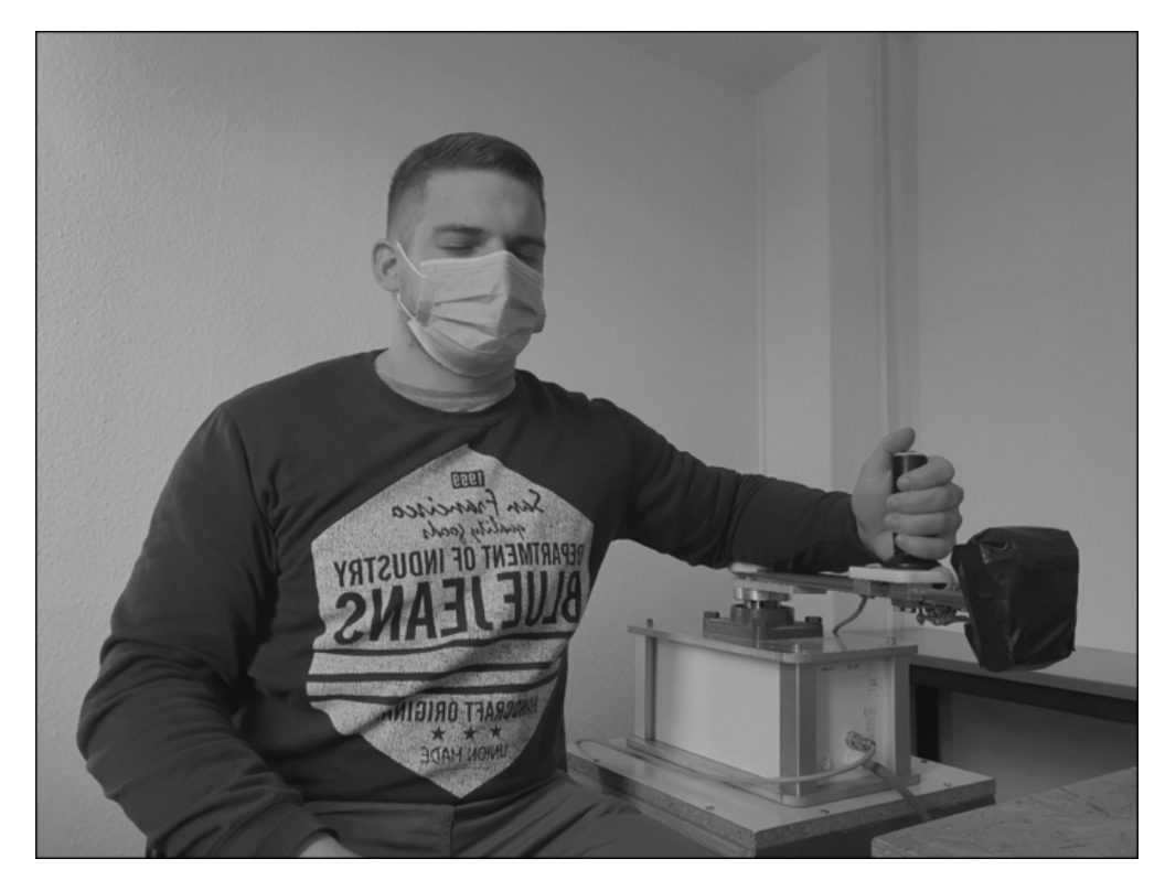
Figure 1. The motor-driven proprioceptor used for the measurements 29x22mm (600 x 600 DPI)