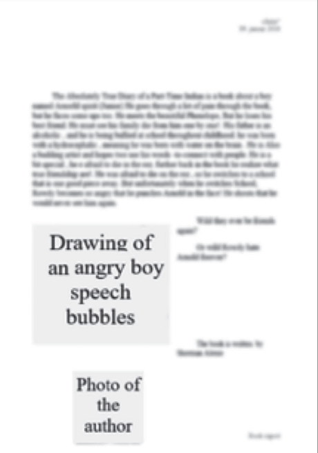
Figure 5.2: Modified pages of Julie's essay text

Note: This figure illustrates the placement of image and writing in Julie's layout. The original images are modified to prevent copyright infringement. Furthermore, Julie's text is blurred to the point of illegibility in accordance with the terms for consent to research.