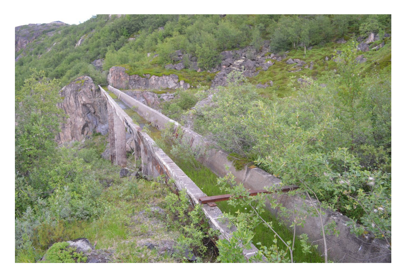
FIGURE 5. 1960s concrete mine tailings tunnel at Sydvaranger (July 2020).