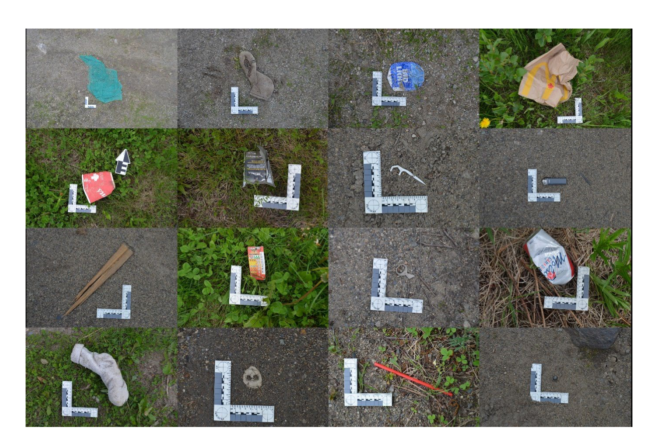
FIGURE 11. Surface survey objects from Labrador City, the solitary iron pellet is on the bottom right (June–July 2021).