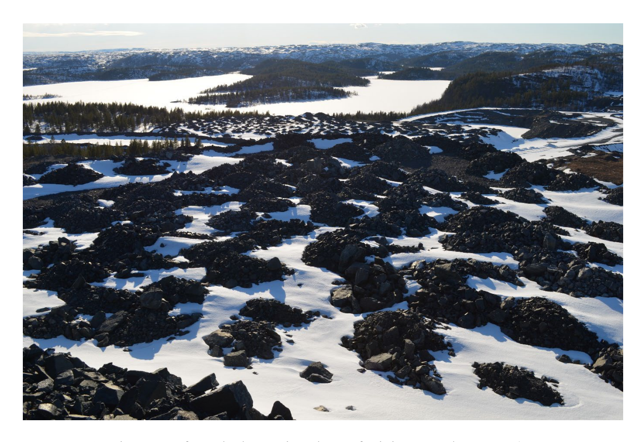
FIGURE 4. Mine waste from the last active phase of mining at Sydvaranger (May 2021).