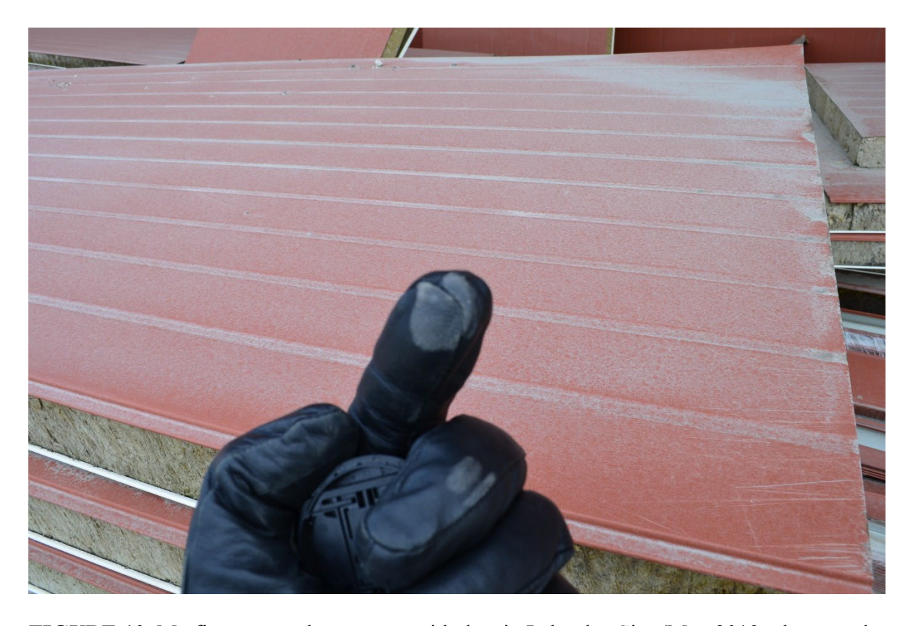
FIGURE 10. My first personal encounter with dust in Labrador City (May 2019).