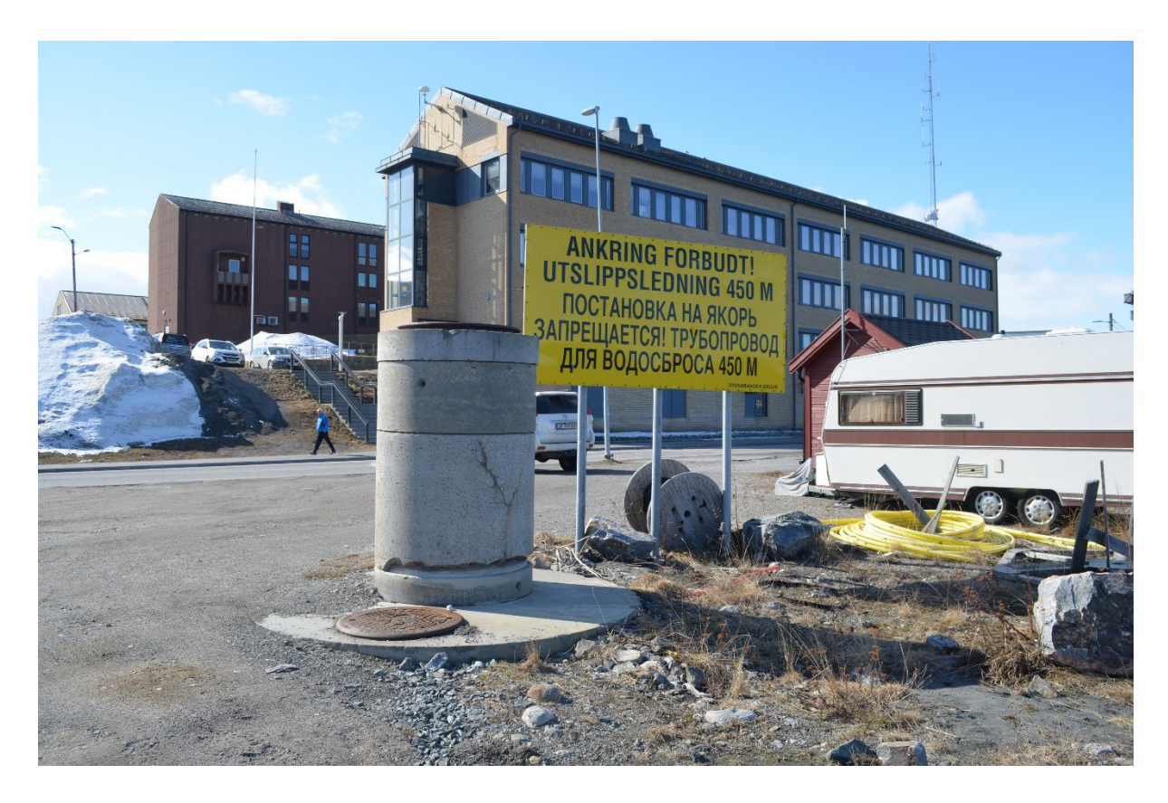
FIGURE 6. One of only two aboveground traces of the 1974 tailings pipe running from the Sydvaranger plant into Bøkfjorden; picture taken on the Kirkenes waterfront (May 2021).