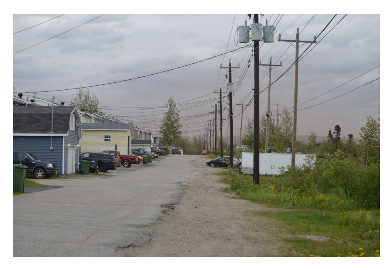
FIGURE 9. Dust from the Scully Mine tailings blowing through Labrador City (June 2021).