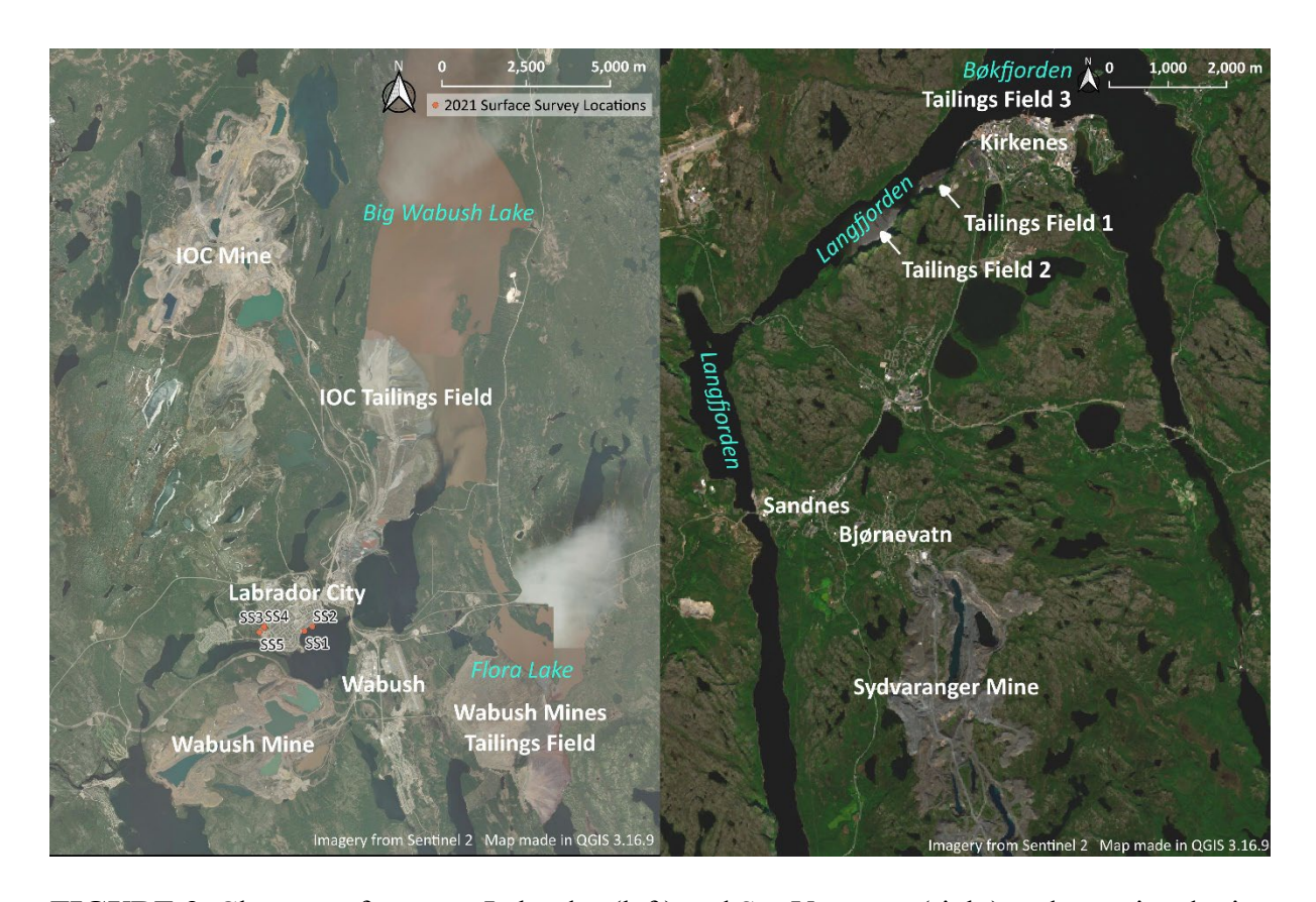
FIGURE 3. Close-up of western Labrador (left) and Sør Varanger (right) and associated mine wastes (maps by author).