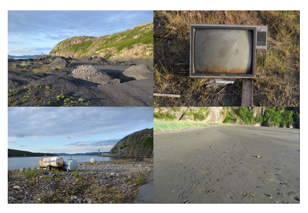
FIGURE 7. Slambanken (July 2020).